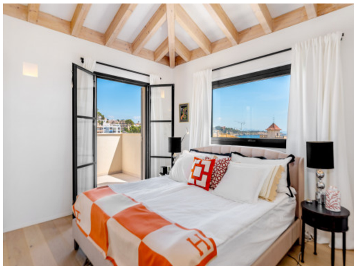
Master bedroom with terrace