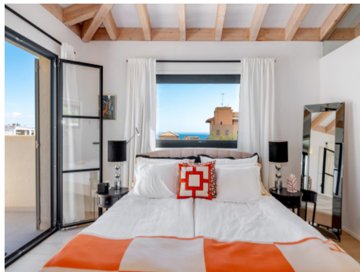
Master bedroom with a view