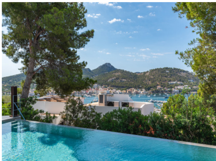
Infinitypool with sea views