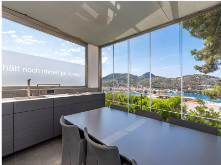
Dining area and kitchen