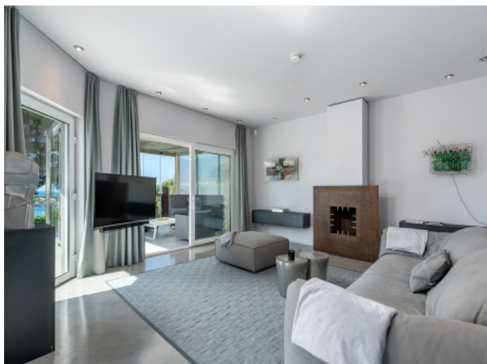
Living area with floor-to-ceiling windows