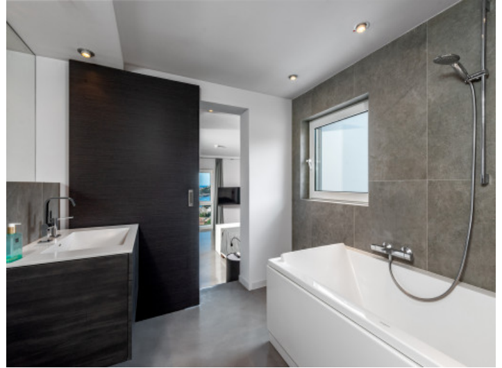
Bathroom with bathtub