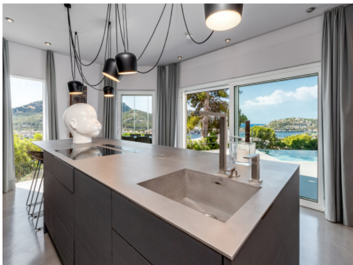
Kitchen with cooking island