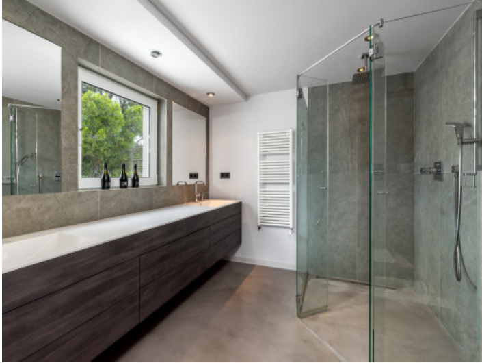
Bathroom with walk-in shower