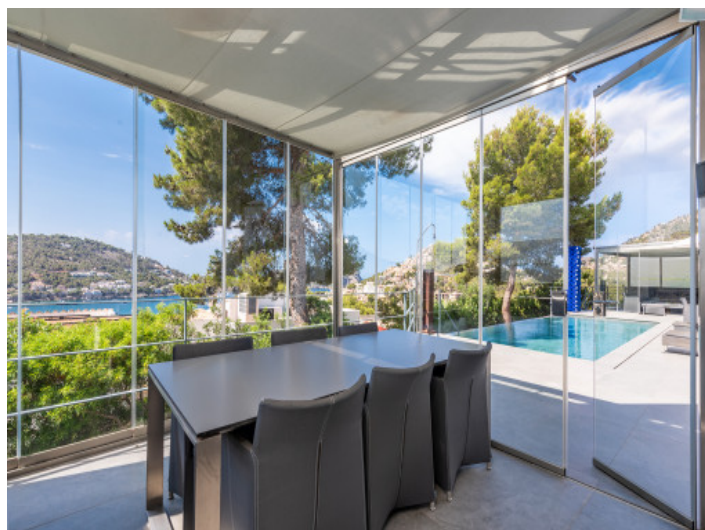
Light flooded dining area

All information is correct to the best of our knowledge. Errors and prior sale excepted. This prospectus is purely for information purposes. Only the notarized deed of sale is legally binding.