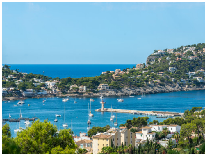
Stunning sea views