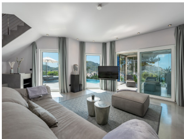
Bright living area