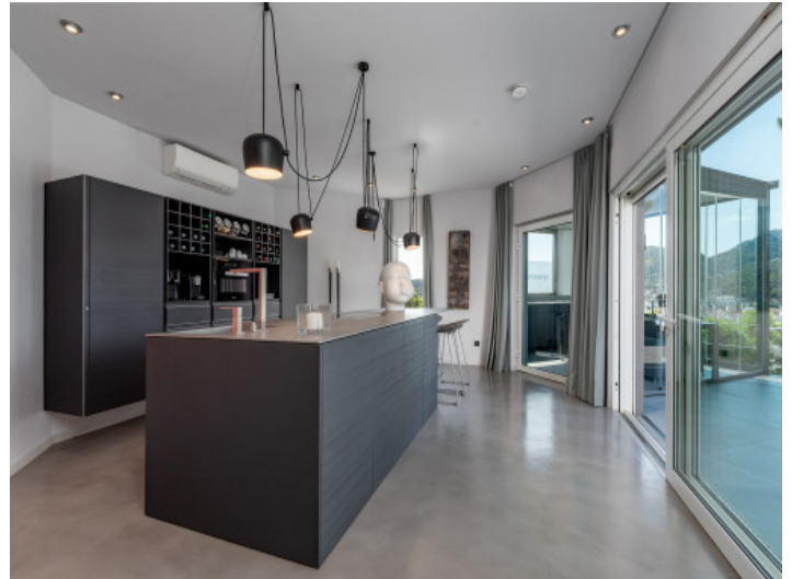
Kitchen with direct terrace access