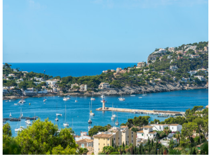
Stunning sea views