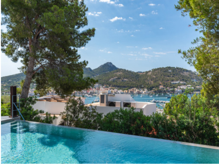
Infinitypool with sea views