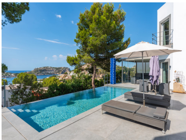
Fantastic pool area