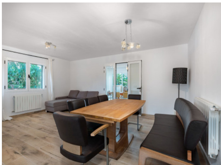
Living and dining area groundfloor