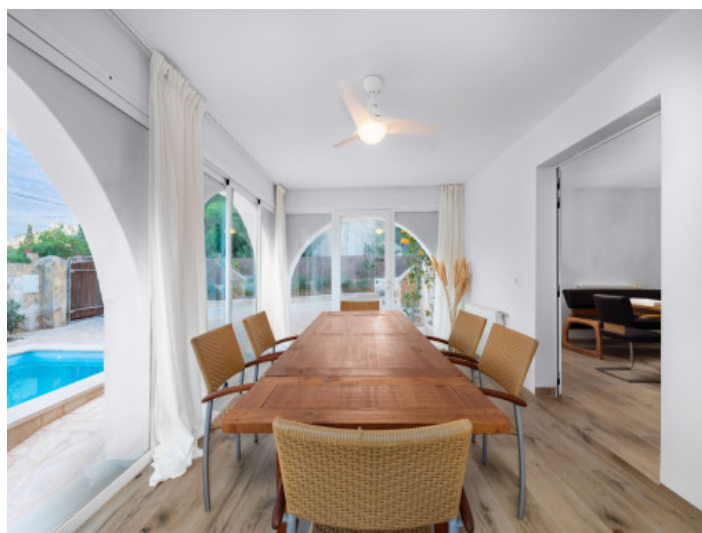
Dining area conservatory