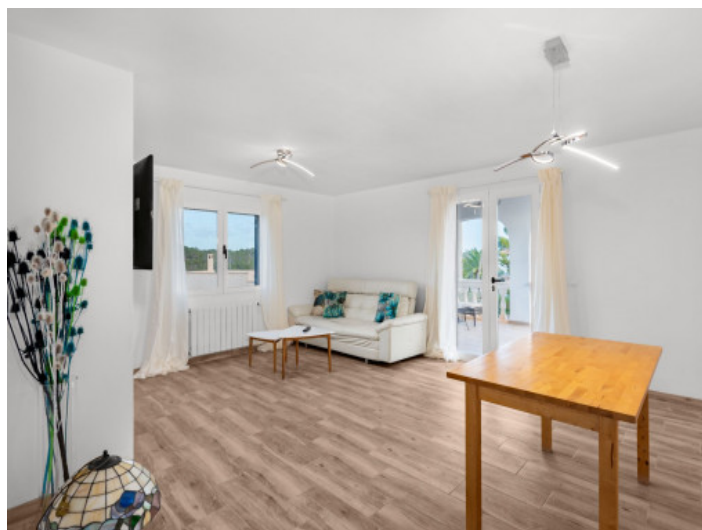
Living and dining area 1. floor

All information is correct to the best of our knowledge. Errors and prior sale excepted. This prospectus is purely for information purposes. Only the notarized deed of sale is legally binding.