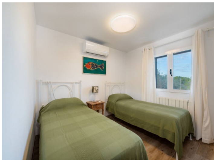
Second bedroom 1. floor