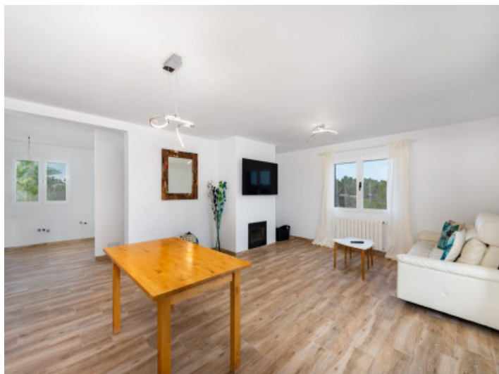
Living and dining area 1. floor