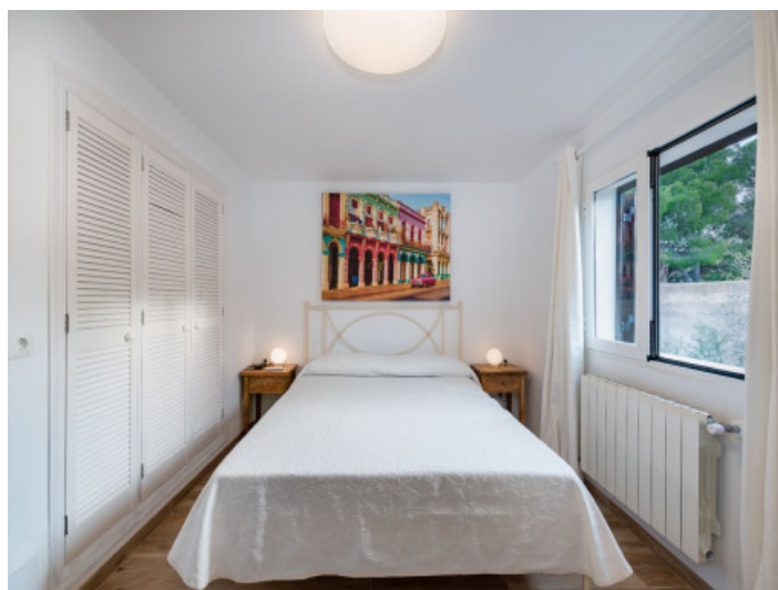
Bedroom 1. floor