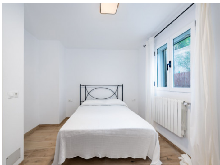
Second bedroom groundfloor