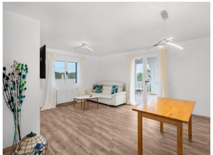
Living and dining area 1. floor

All information is correct to the best of our knowledge. Errors and prior sale excepted. This prospectus is purely for information purposes. Only the notarized deed of sale is legally binding.