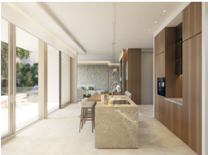
Modern kitchen with island