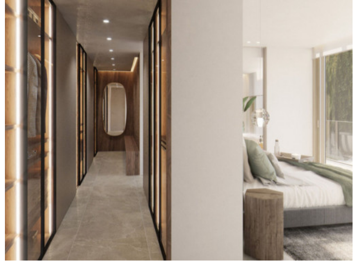
Superb dressing area