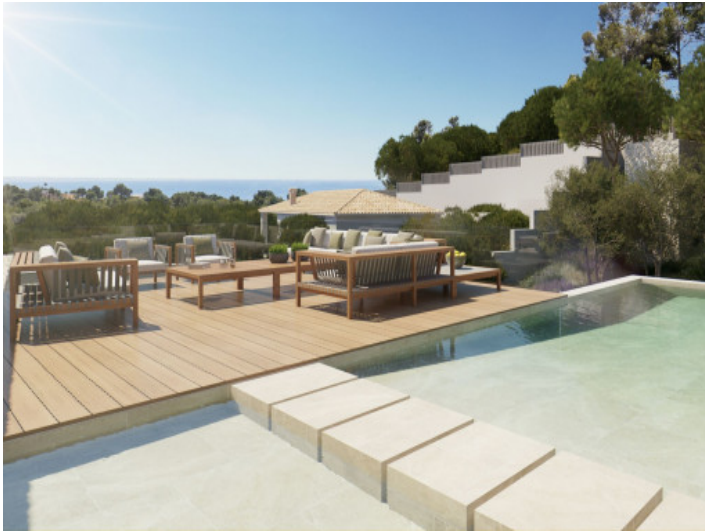
Fantastic pool area with sea views