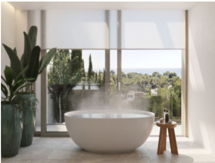
One of 7 bathrooms