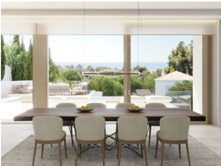
Light-flooded dining area