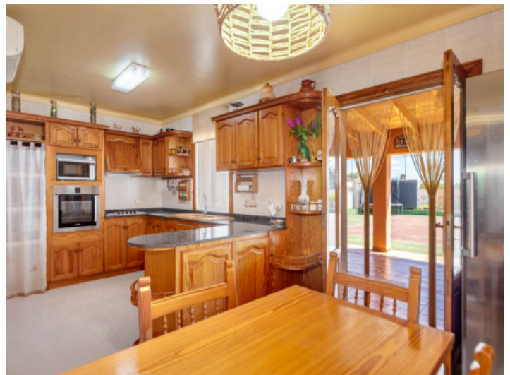
Country style kitchen