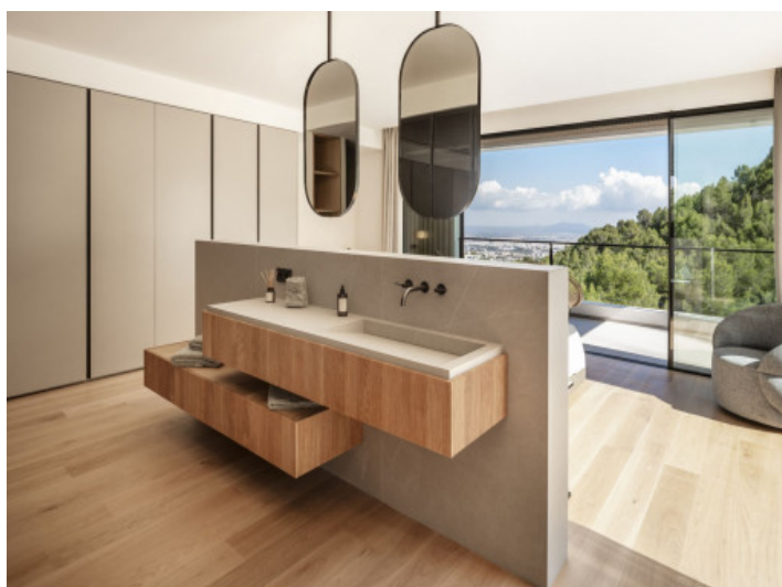
Wash basin in the bedroom