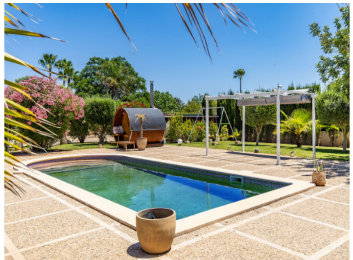
Very well maintained pool and garden area

All information is correct to the best of our knowledge. Errors and prior sale excepted. This prospectus is purely for information purposes. Only the notarized deed of sale is legally binding.