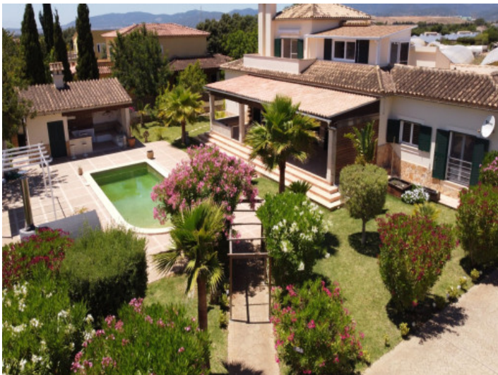
Very well maintained villa