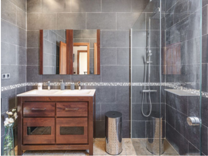
One of 4 bathrooms