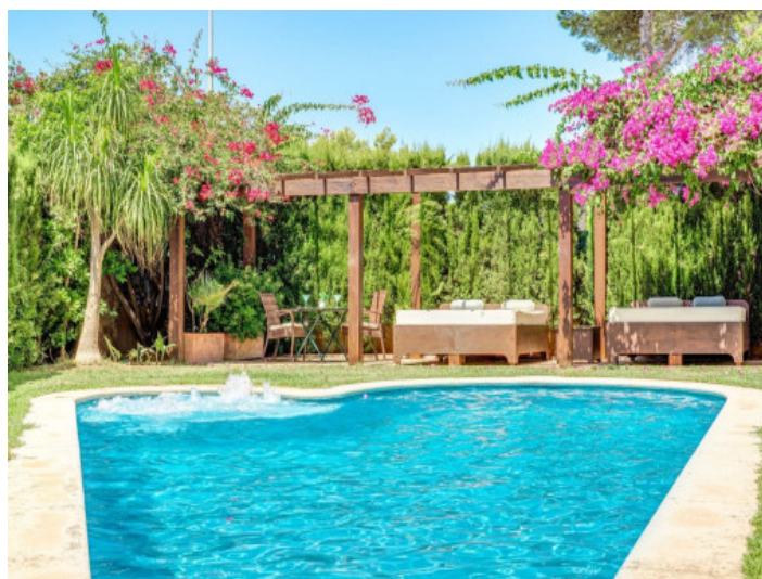
Beautiful garden and pool