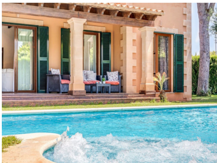
Holiday rental licence for up to 8 guests