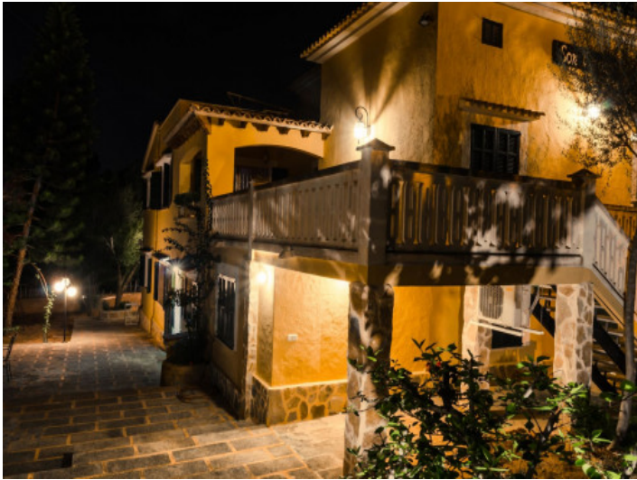
The property by night