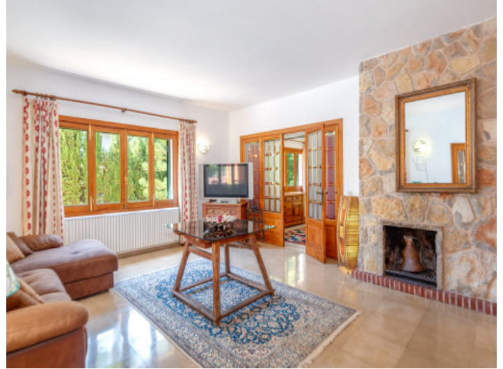
Another living area