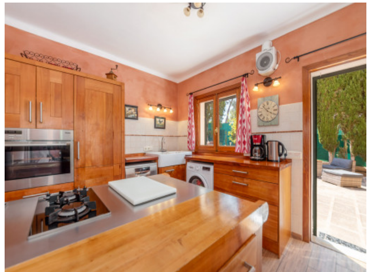
Country style kitchen