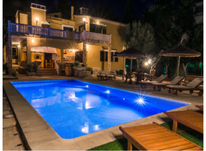
Beautiful property at night