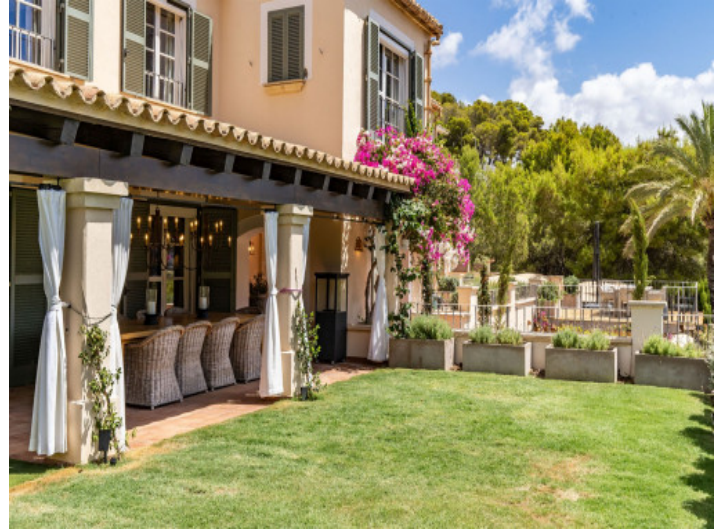
Villa in top location