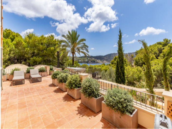
Terrace with sea view