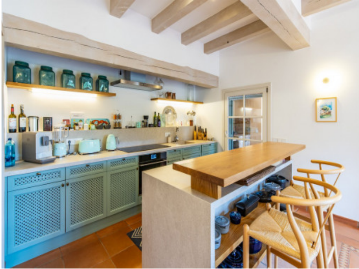
Country style kitchen