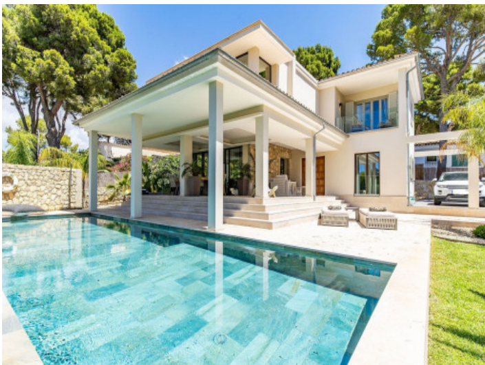
Villa in top location