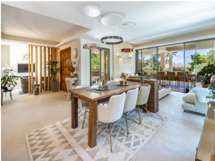
Bright dining area