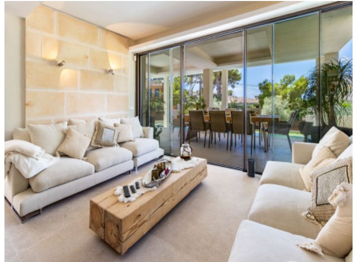
Cozy living area