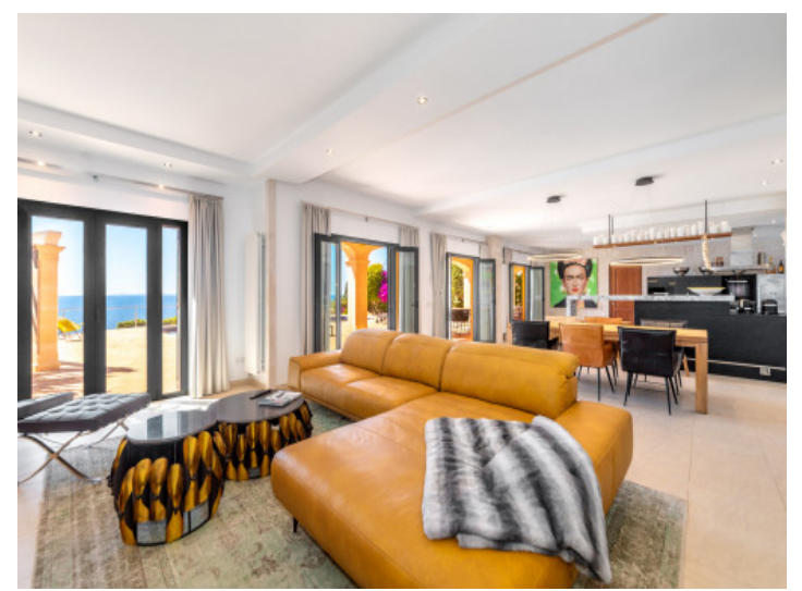
Large living area Living area with fireplace All information is correct to the best of our knowledge. Errors and prior sale excepted. This prospectus is purely for information purposes. Only the notarized deed of sale is legally binding.