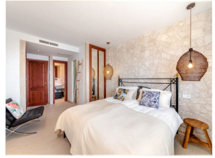
Bedroom with bathroom en suite

PORTA MALLORQUINA® Your home. Our passion.