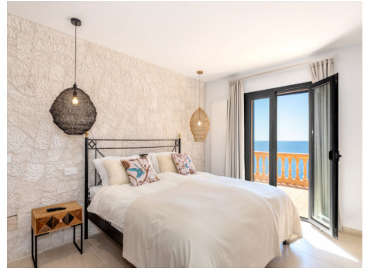
Third bedroom with bathroom en suite