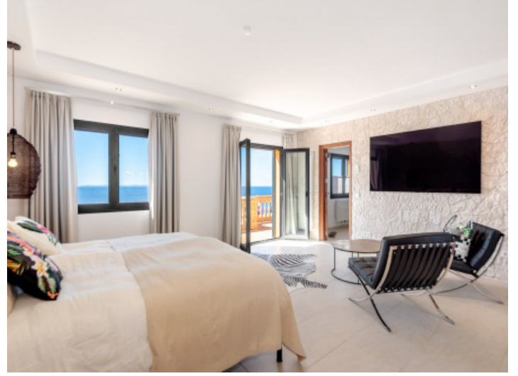
Mastersuite Bathroom mastersuite All information is correct to the best of our knowledge. Errors and prior sale excepted. This prospectus is purely for information purposes. Only the notarized deed of sale is legally binding.