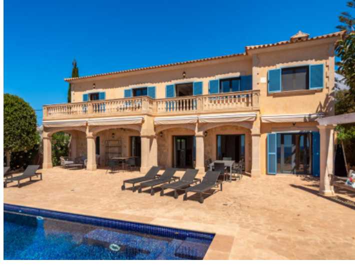
Amazing views from the first floor terrace Facade All information is correct to the best of our knowledge. Errors and prior sale excepted. This prospectus is purely for information purposes. Only the notarized deed of sale is legally binding.