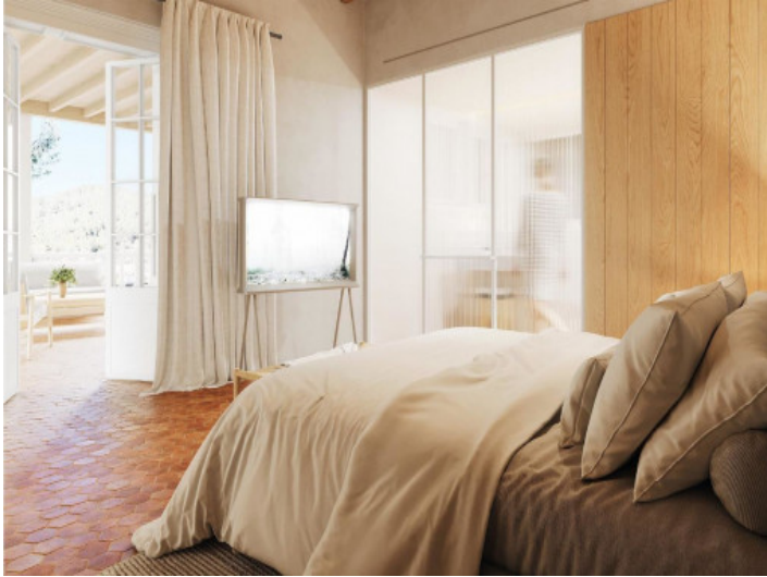
All bedrooms with bathroom en suite