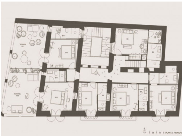
Floorplan 1st floor