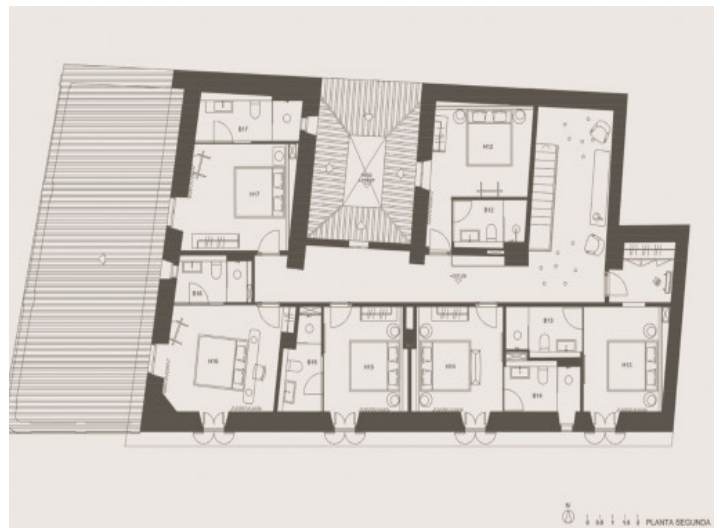
Floorplan 2nd floor

All information is correct to the best of our knowledge. Errors and prior sale excepted. This prospectus is purely for information purposes. Only the notarized deed of sale is legally binding.