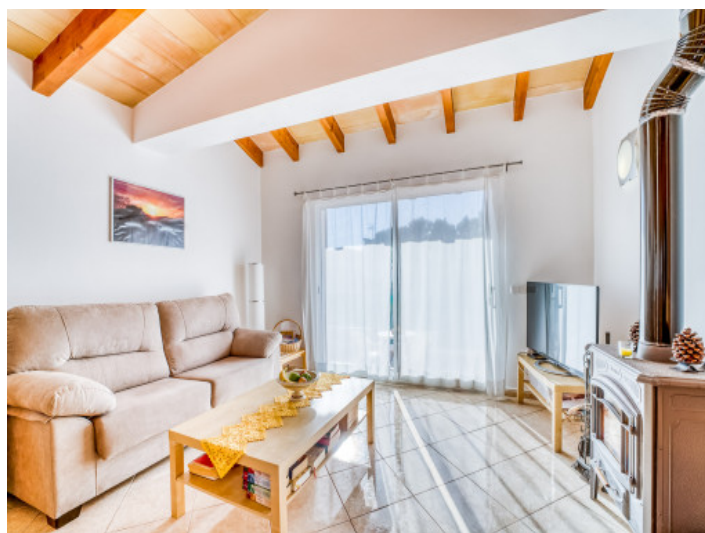
Bright living area with fireplace