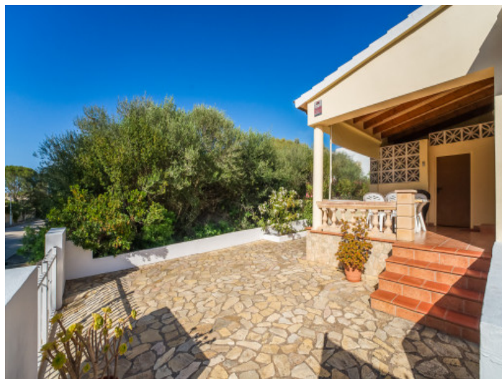
View to the house