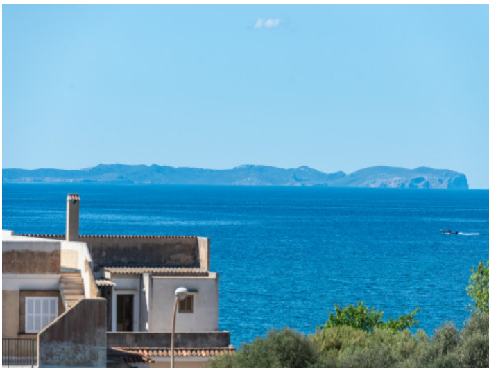
Mediterran sea views