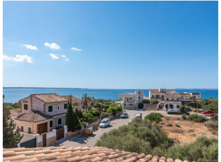
Mediterran des views