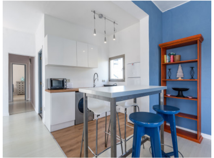
Kitchen with bar