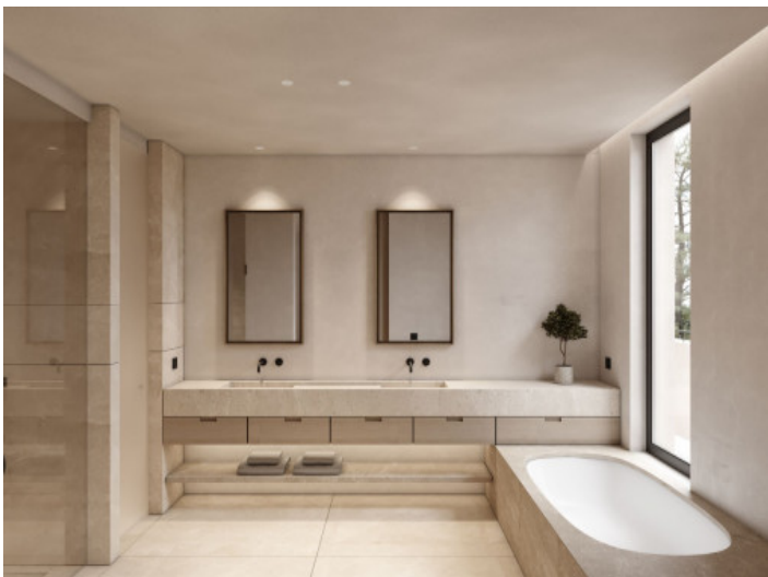
En suite bathroom