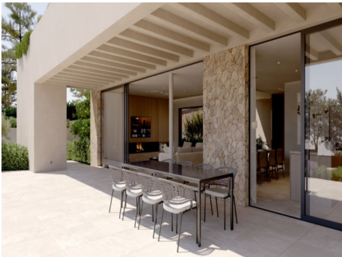
Large porched veranda