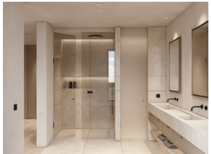
Bathroom with floor - level shower

All information is correct to the best of our knowledge. Errors and prior sale excepted. This prospectus is purely for information purposes. Only the notarized deed of sale is legally binding.