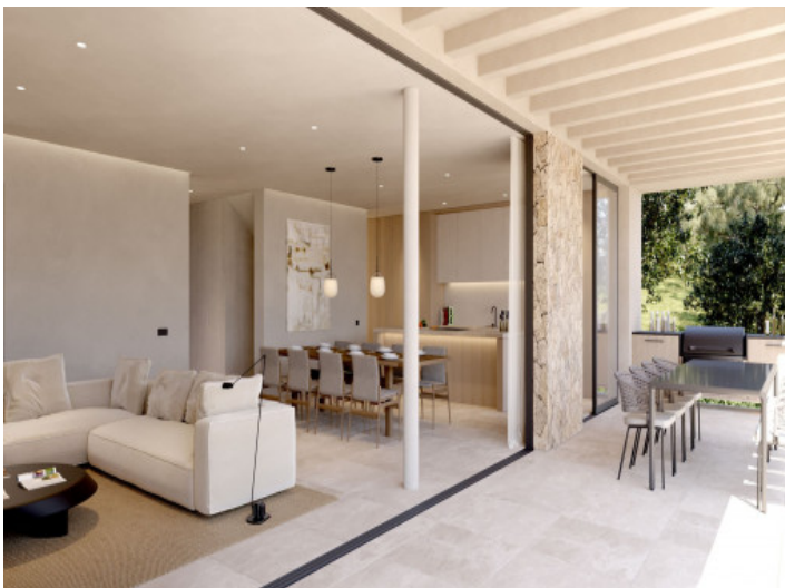
Open room layout