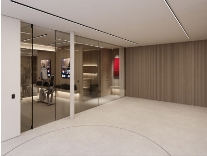
Fitness and sauna