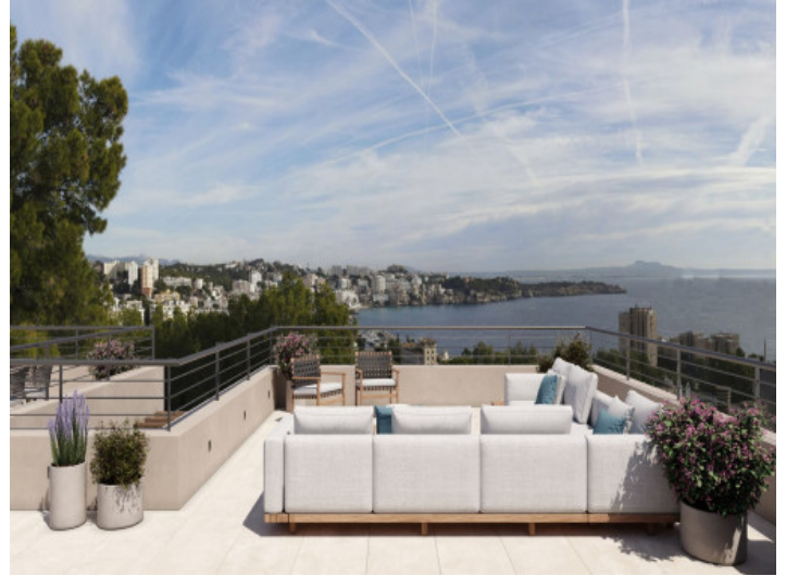
Comfortable rooftop terrace