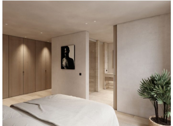
Bedroom with bathroom en suite