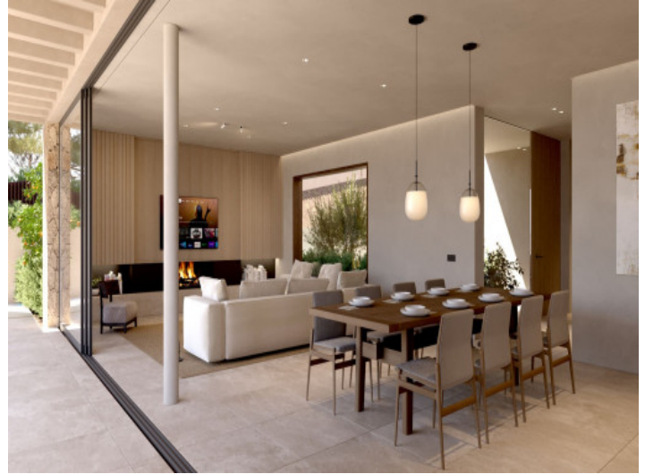
Living and dining area