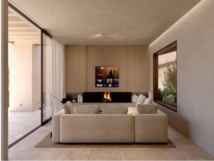
Comfortable living room with fireplace