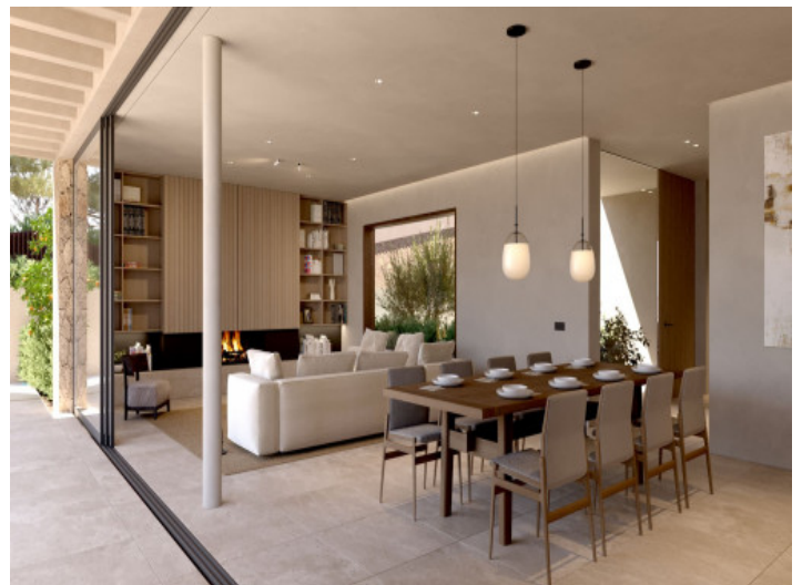
Bright living and dining room

All information is correct to the best of our knowledge. Errors and prior sale excepted. This prospectus is purely for information purposes. Only the notarized deed of sale is legally binding.