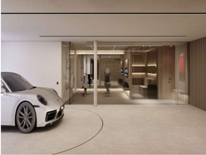
Fitness area and sauna