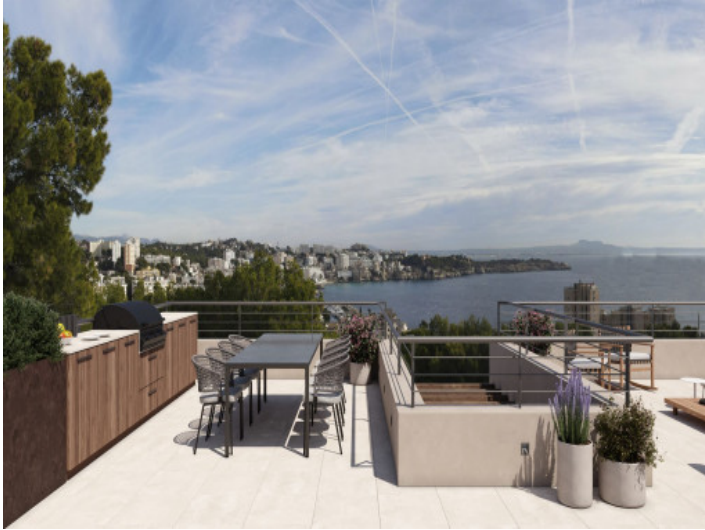
Rooftop with amazing view