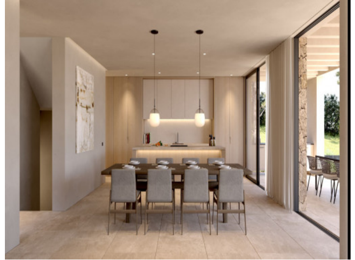
Modern kitchen with dining area