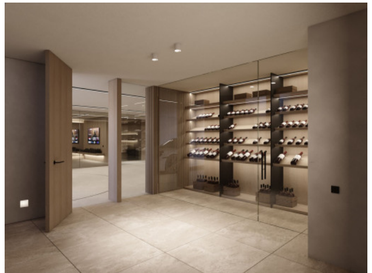
Nice wine cellar