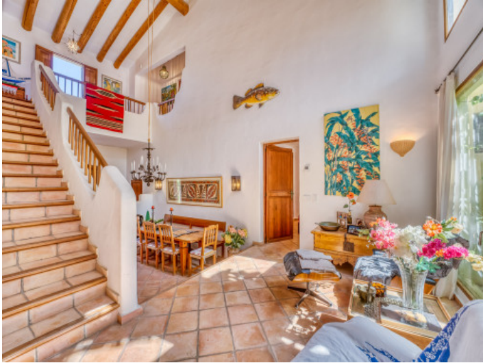
Staircase to the upper floor