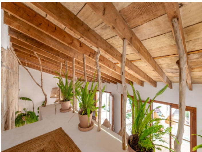
Chill out area