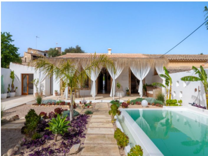
Beautiful villa with pool in Establiments