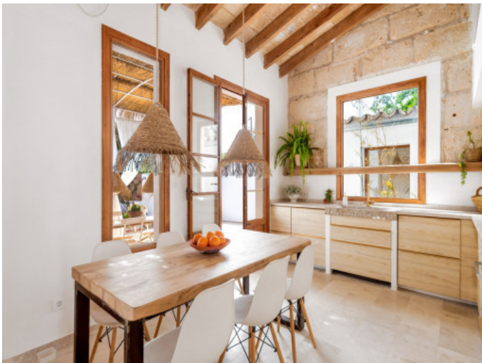
Dining area and kitchen