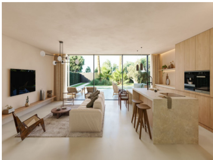
Open plan design