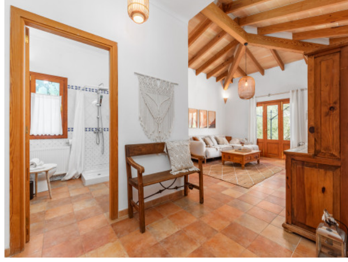
Living area and corridor