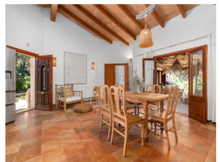
Dining area Dining and kitchen area All information is correct to the best of our knowledge. Errors and prior sale excepted. This prospectus is purely for information purposes. Only the notarized deed of sale is legally binding.