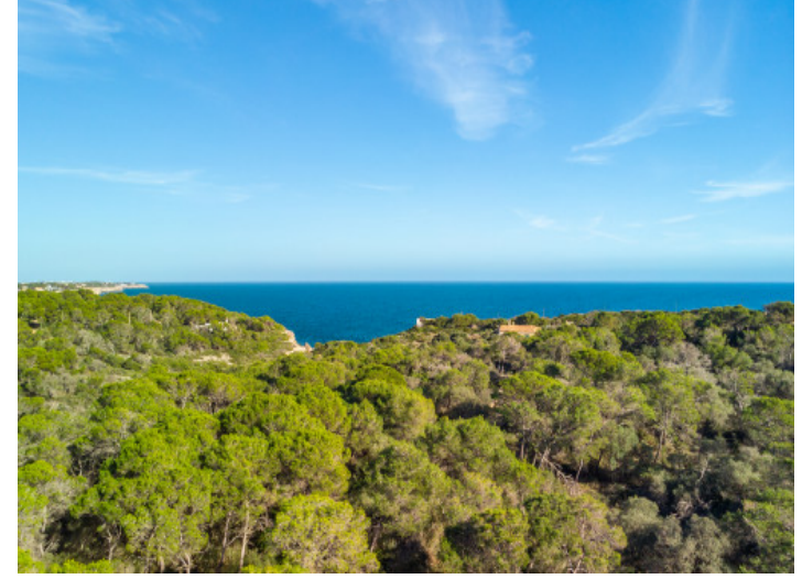
Stunning views to the sea