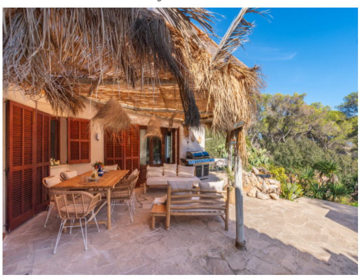
Idyllic terrace with dining and lounge area