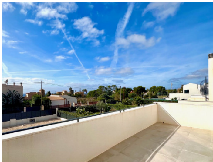
Beautiful roof terrace