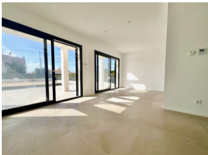
Light-flooded dining area