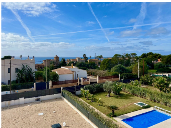
Lovely views from the upper floor