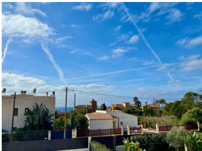
Partial sea views