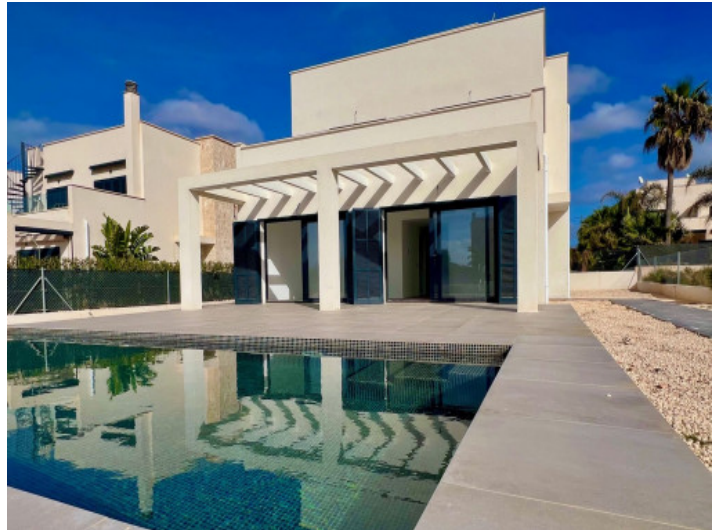
Exterior view of the modern villa