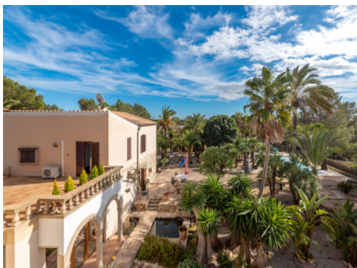
View over the garden