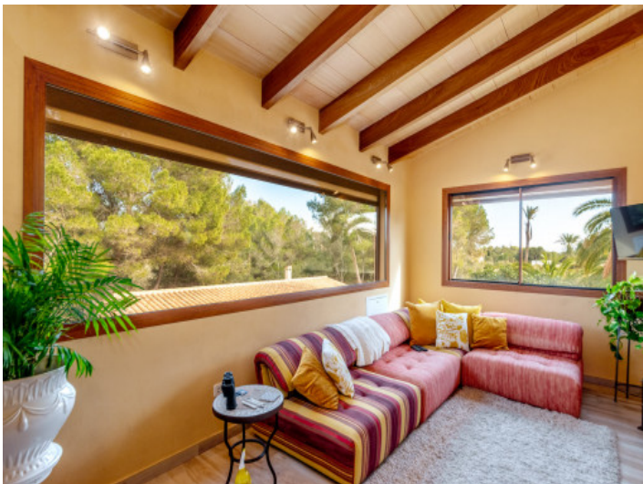
Living area 2