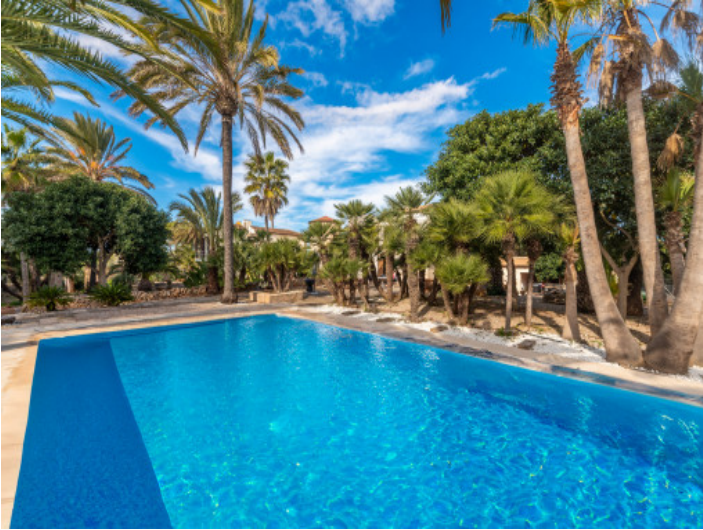
Amazing pool area