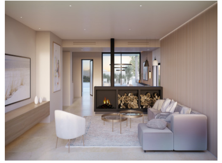
Cozy living area with fireplace

PORTA MALLORQUINA® Your home. Our passion.