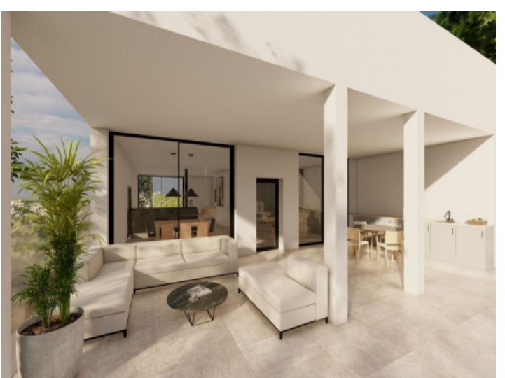
Outdoor dining area Covered terrace with seating All information is correct to the best of our knowledge. Errors and prior sale excepted. This prospectus is purely for information purposes. Only the notarized deed of sale is legally binding.

PORTA MALLORQUINA • C./ CONQUISTADOR 8, 07001 PALMA TEL. +34 971 698 242 • INFO@PORTAMALLORQUINA.COM