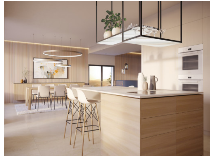
Open plan kitchen and dining area