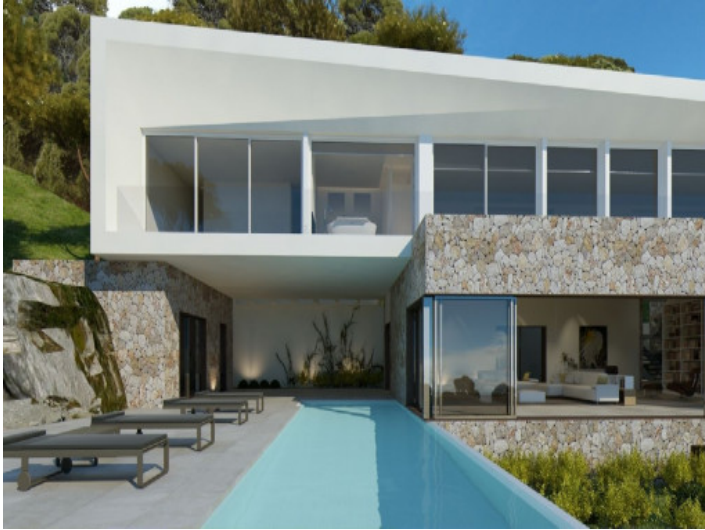
Front view and pool area