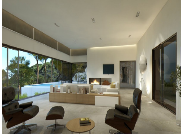
Living area with large window facade