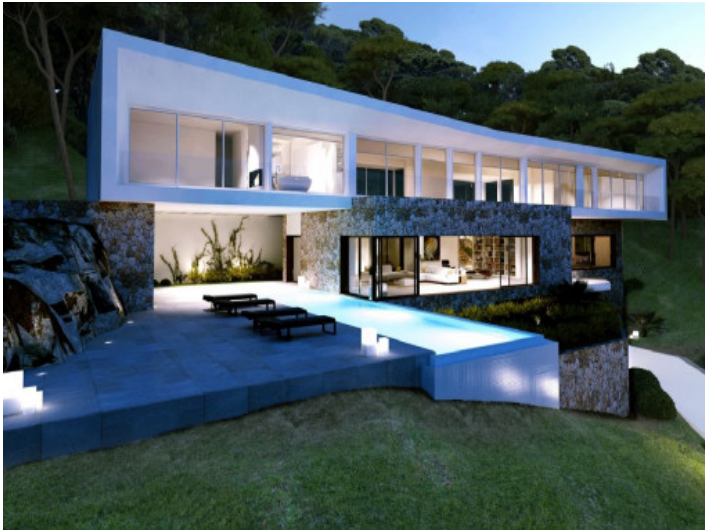
Exterior view by night

All information is correct to the best of our knowledge. Errors and prior sale excepted. This prospectus is purely for information purposes. Only the notarized deed of sale is legally binding.