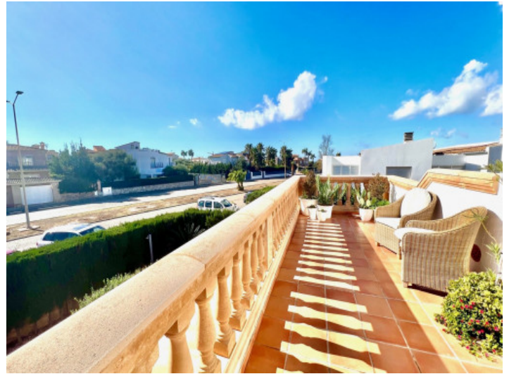
Large upper terrace