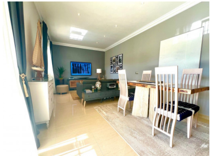
Light-flooded living and dining area