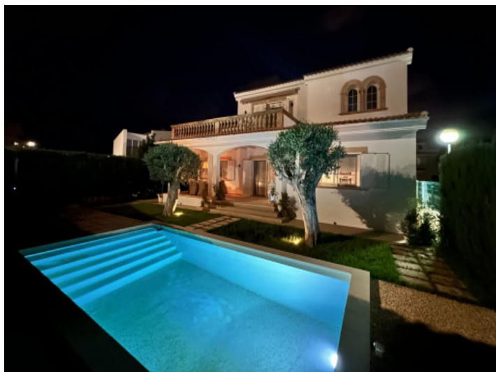
Exterior view by night