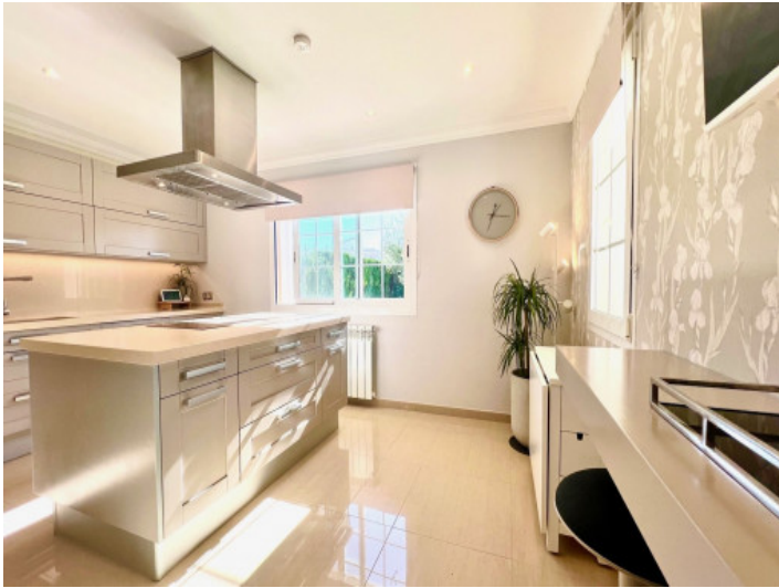
Modern kitchen with island