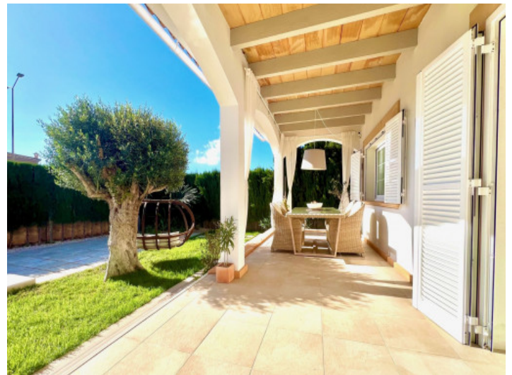
Lovely covered terrace