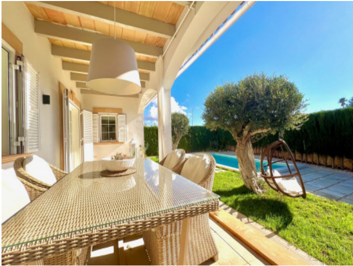
Covered terrace with outdoor dining area