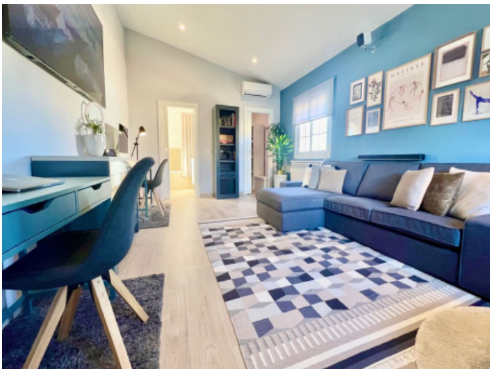
Second living area