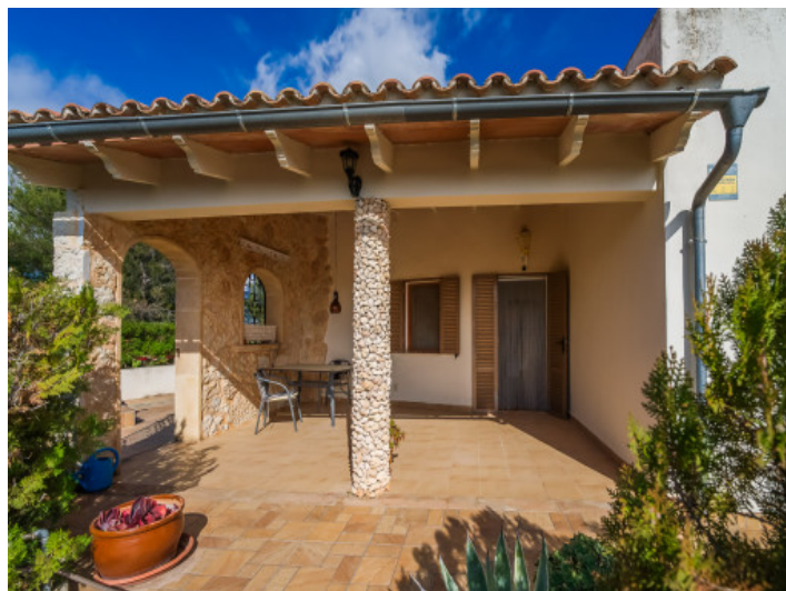
Terrace and entrance