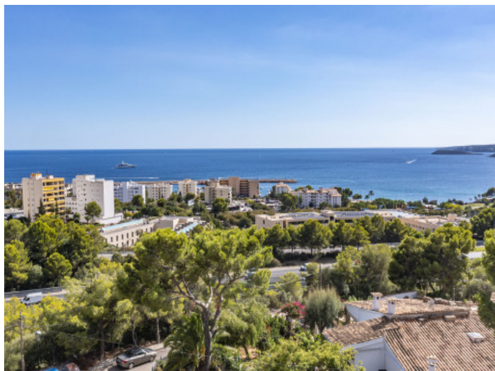
Fantastic sea views