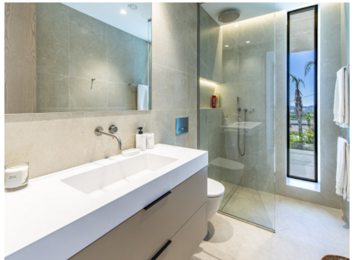
Bathroom with daylight