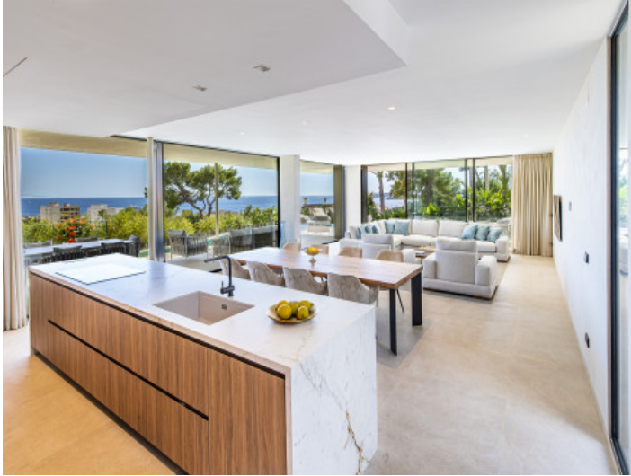
Kitchen with cooking island