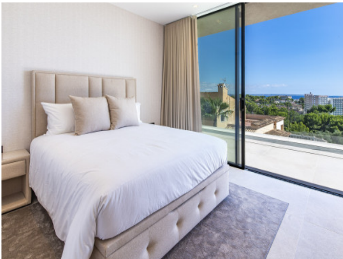
Bedroom with balcony access