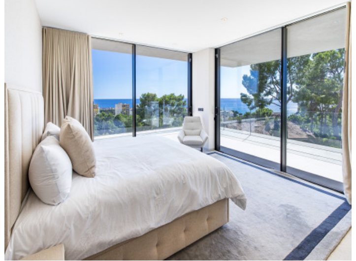
Light flooded bedroom