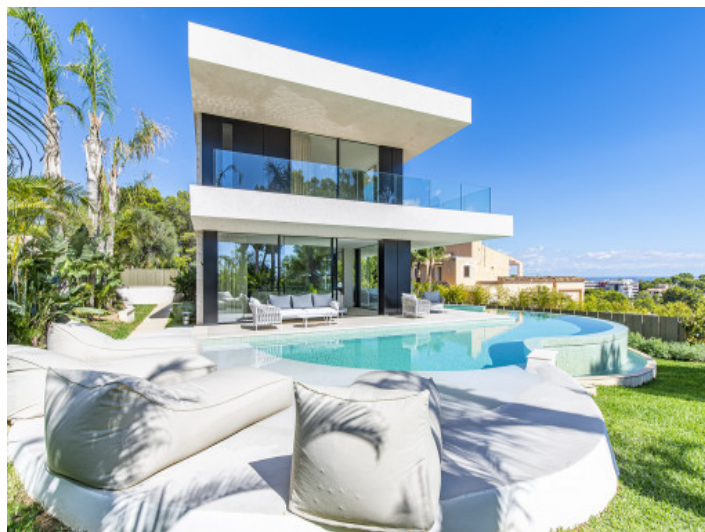
Modern pool area with terrace