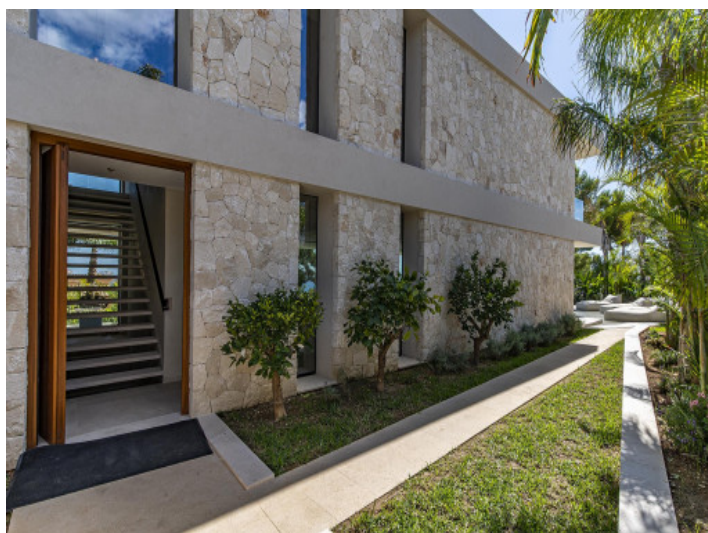
Entrance from the villa