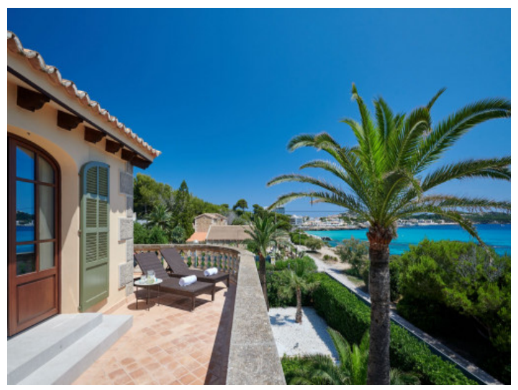
Sea view balcony