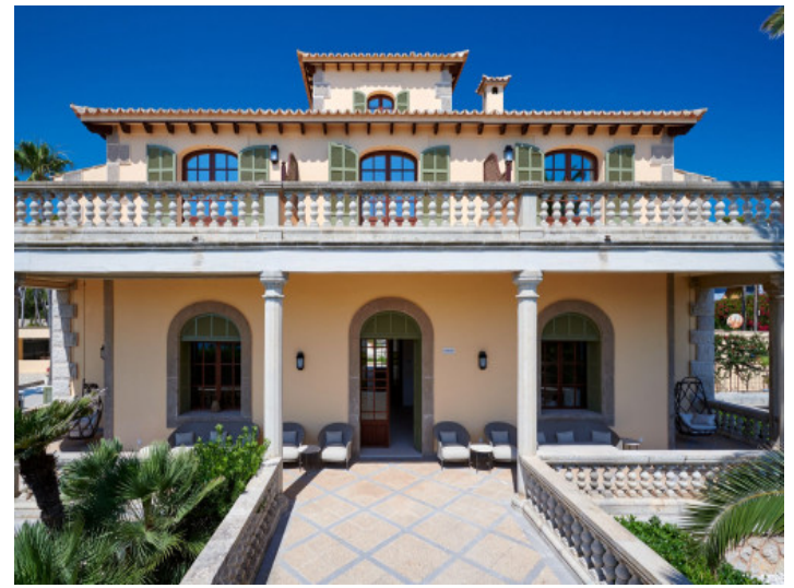
Access to the villa