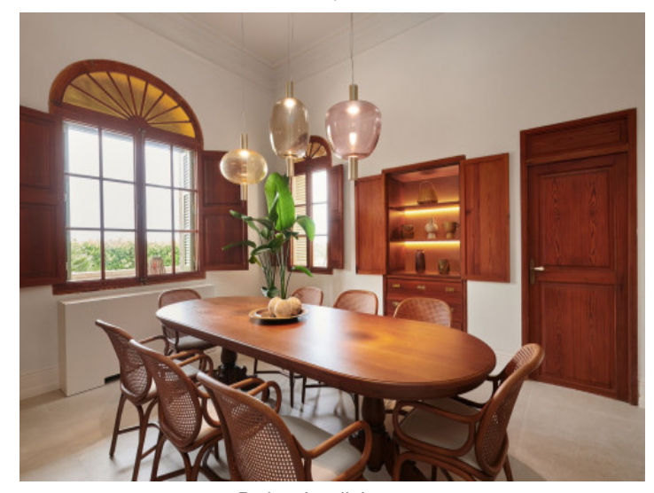
Enchanting dining area