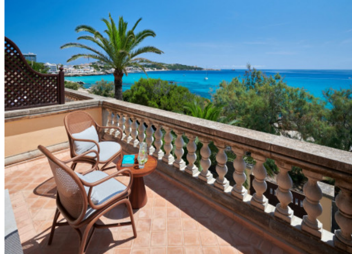
Sea view balcony