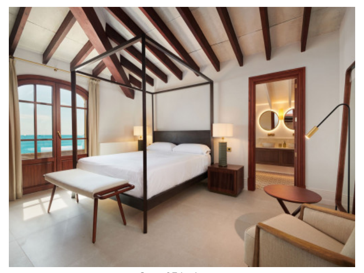
One of 7 bedrooms