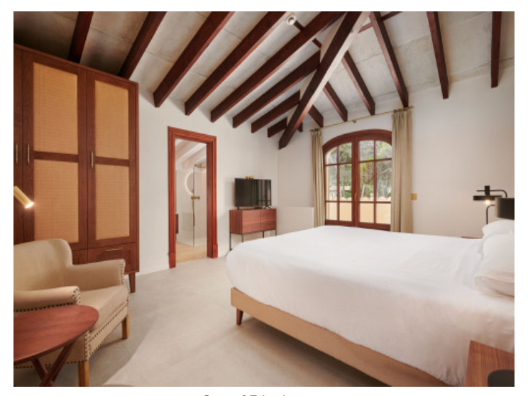
One of 7 bedrooms