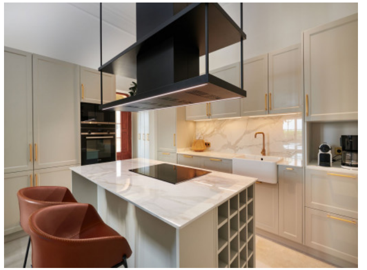
Modern kitchen with island

All information is correct to the best of our knowledge. Errors and prior sale excepted. This prospectus is purely for information purposes. Only the notarized deed of sale is legally binding.