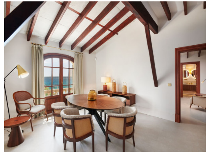
Further seating area

All information is correct to the best of our knowledge. Errors and prior sale excepted. This prospectus is purely for information purposes. Only the notarized deed of sale is legally binding.