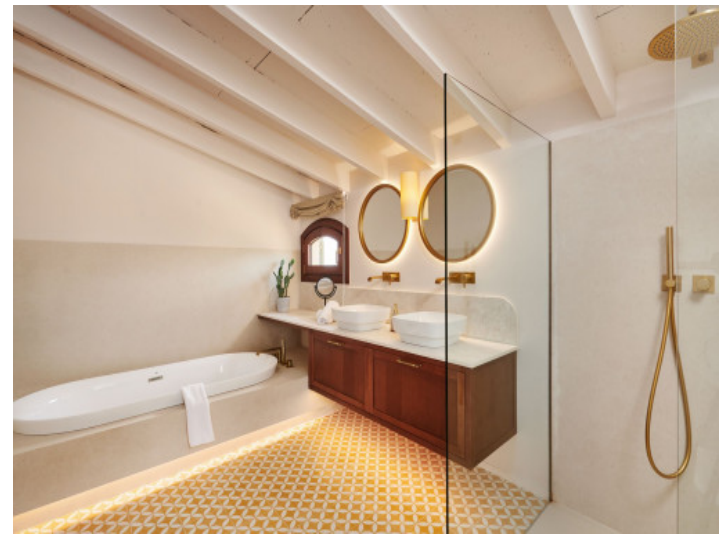
One of 8 bathrooms