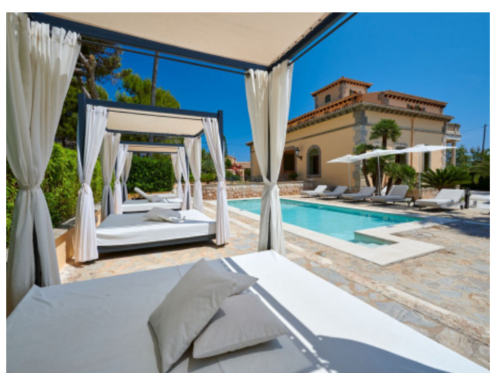
Relaxing pool area