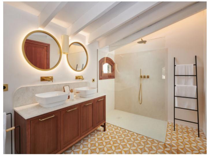
One of 8 bathrooms