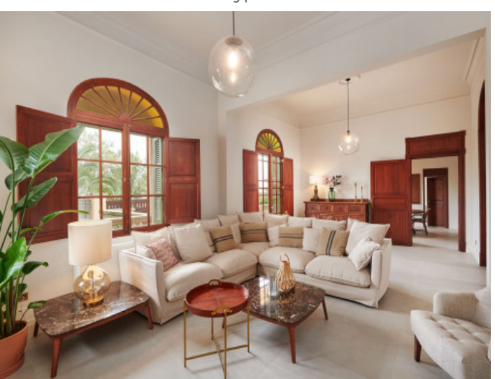
Living area with lots of character