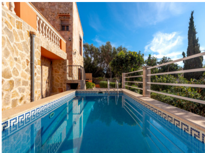
Refreshing pool for summer days