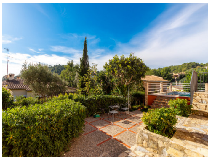
Lovely terrace and garden