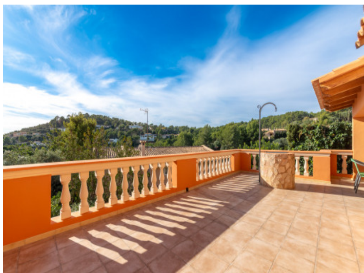
Large sun terrace