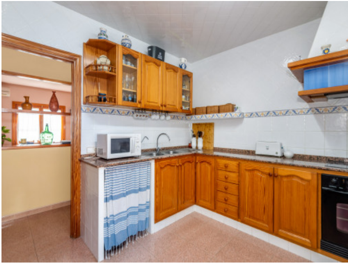
Country house kitchen