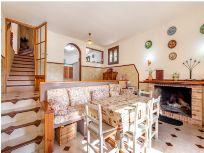
Rustic fireplace dining area