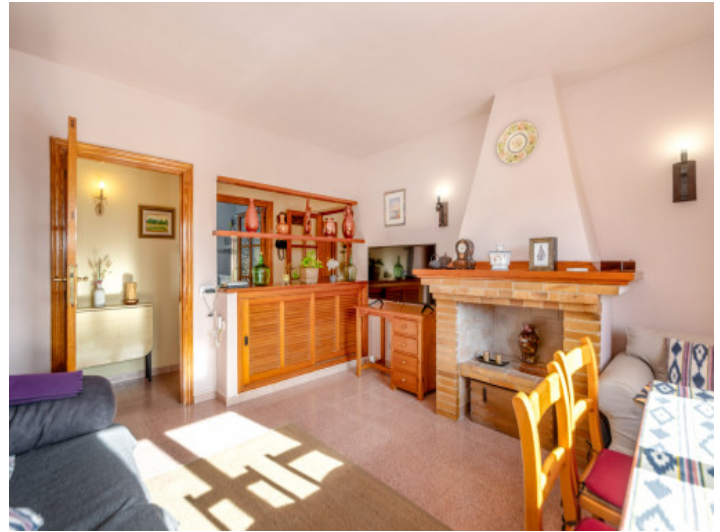
Second living area with fireplace