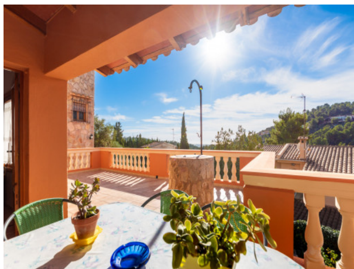
Partly covered dining terrace