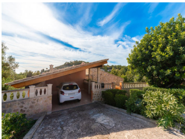
Access and garage