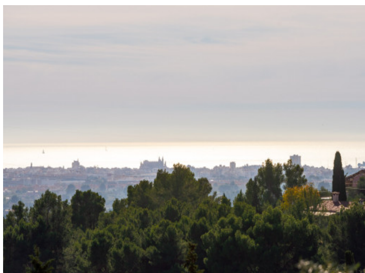
Panorama views as far as Palma