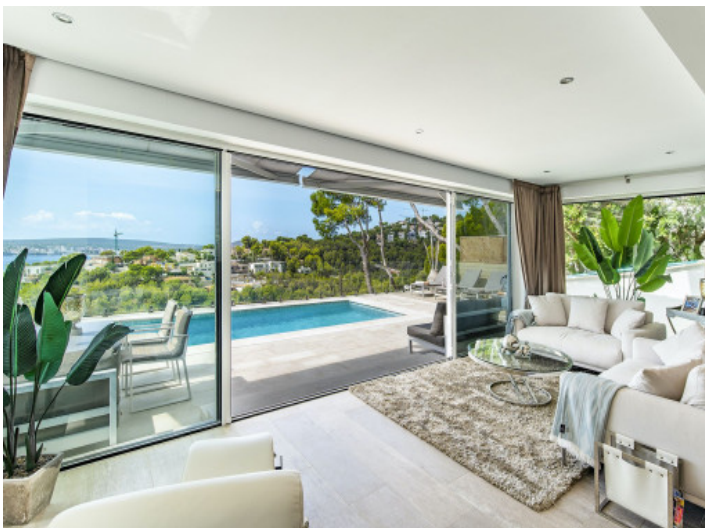
Living area with direct access to a terrace