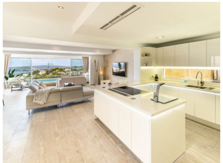
Open living and dining area with the kitchen

All information is correct to the best of our knowledge. Errors and prior sale excepted. This prospectus is purely for information purposes. Only the notarized deed of sale is legally binding.