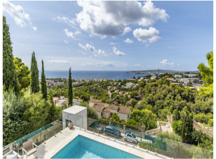
Fantastic sweeping views