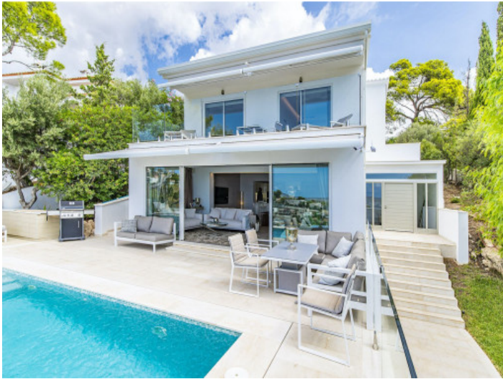
Modern luxurious villa