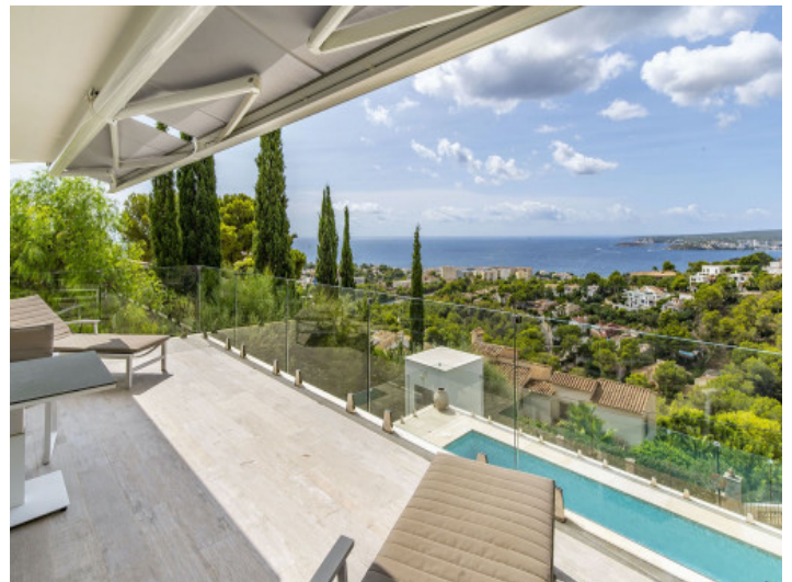
Sunny terrace with awning