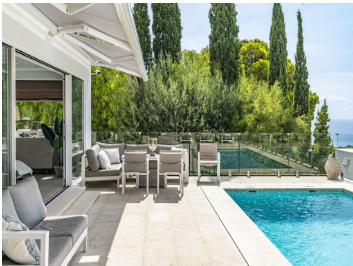
Lovely pool area