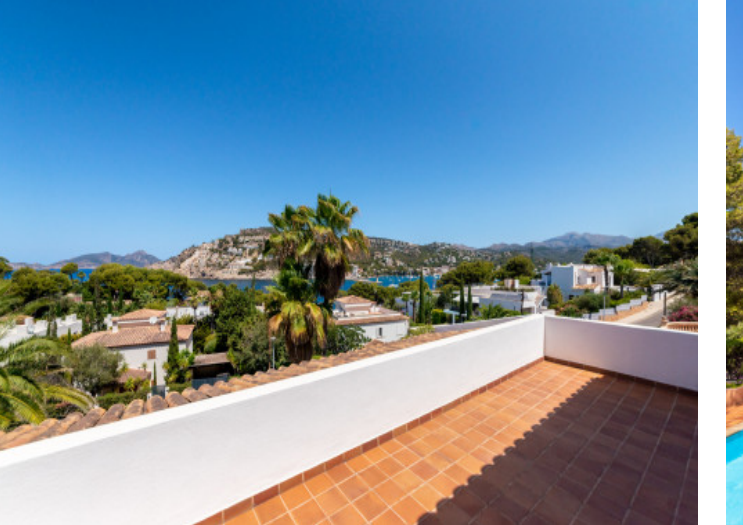
Upper terrace with a view Dreamlike pool area All information is correct to the best of our knowledge. Errors and prior sale excepted. This prospectus is purely for information purposes. Only the notarized deed of sale is legally binding.

PORTA MALLORQUINA • C./ CONQUISTADOR 8, 07001 PALMA TEL. +34 971 698 242 • INFO@PORTAMALLORQUINA.COM