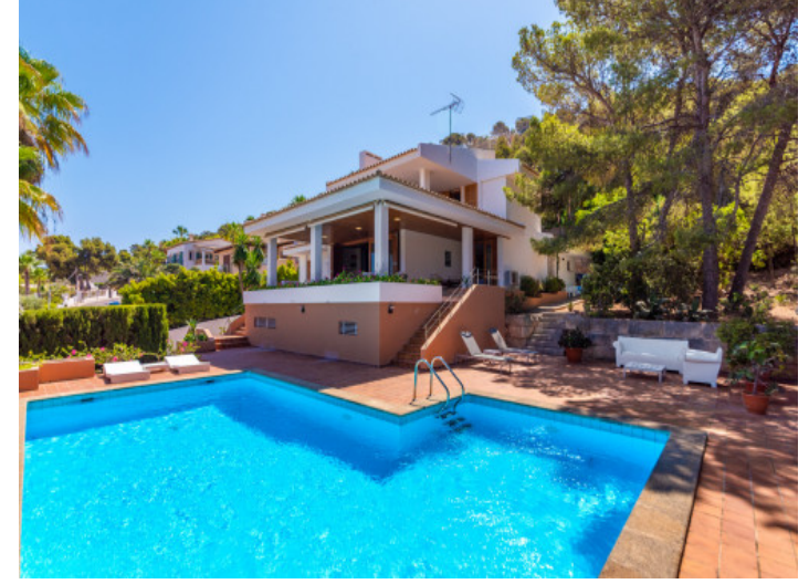
Pool area and terraces