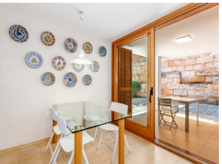
Dining area with direct terrace access Fully equipped kitchen All information is correct to the best of our knowledge. Errors and prior sale excepted. This prospectus is purely for information purposes. Only the notarized deed of sale is legally binding.

PORTA MALLORQUINA • C./ CONQUISTADOR 8, 07001 PALMA TEL. +34 971 698 242 • INFO@PORTAMALLORQUINA.COM