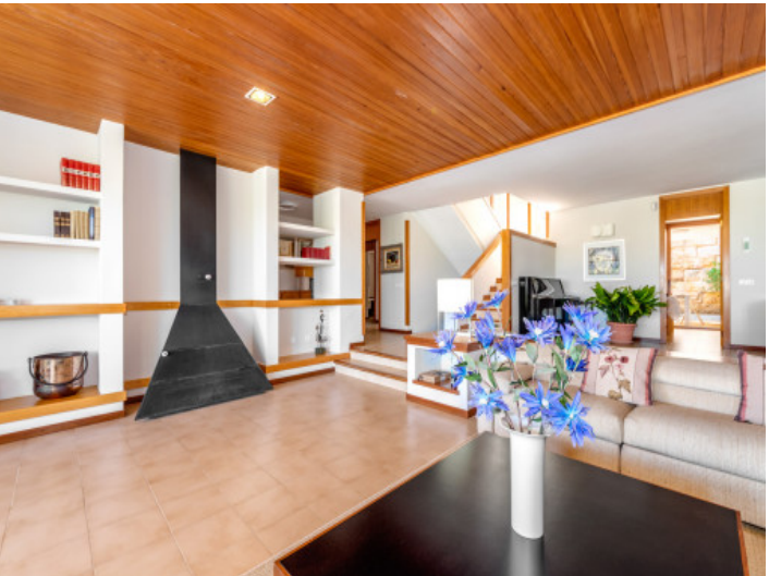
Large, open living area