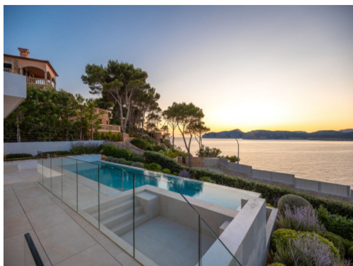
Gorgeous sea views from the terrace

All information is correct to the best of our knowledge. Errors and prior sale excepted. This prospectus is purely for information purposes. Only the notarized deed of sale is legally binding.