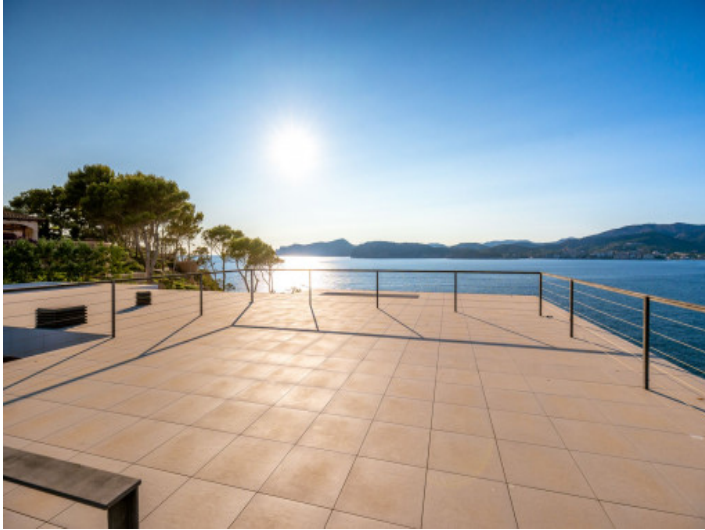
Large sea view roof terrace