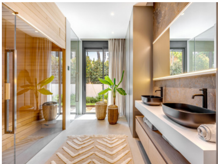
Luxury bathroom with sauna