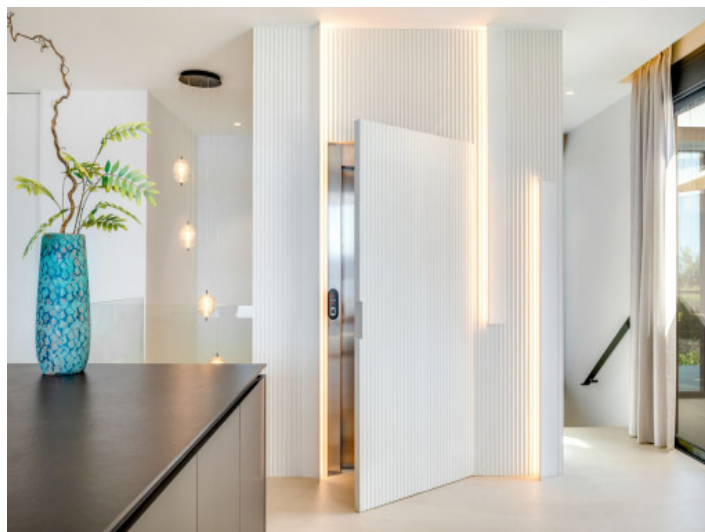
A lift connects the floors