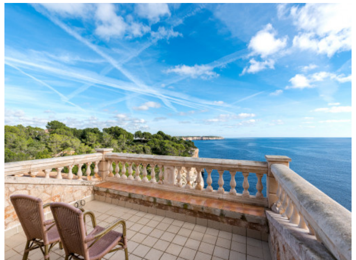
Magnificent roof terrace with sea views

All information is correct to the best of our knowledge. Errors and prior sale excepted. This prospectus is purely for information purposes. Only the notarized deed of sale is legally binding.