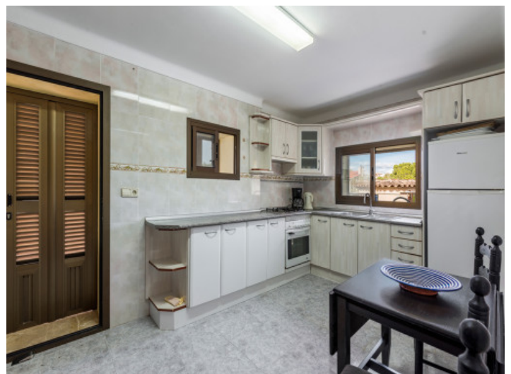
Second kitchen of the property

All information is correct to the best of our knowledge. Errors and prior sale excepted. This prospectus is purely for information purposes. Only the notarized deed of sale is legally binding.