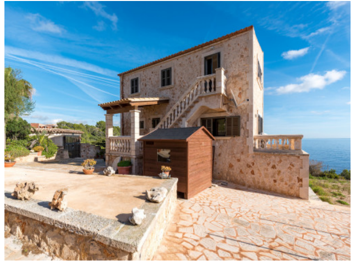
Front view of the villa with stone facade