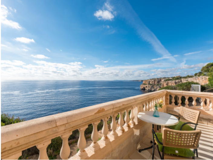
Stunning sea view terrace