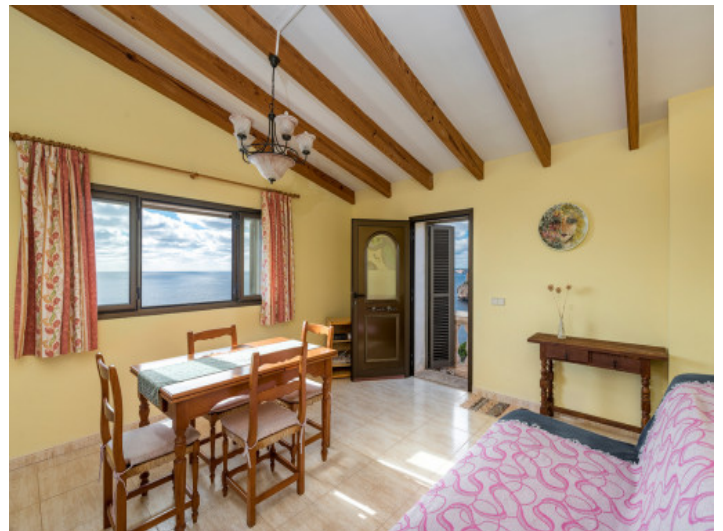
Further dining area with wooden ceiling beams