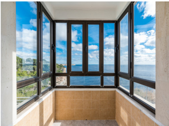
Beautiful panoramic views