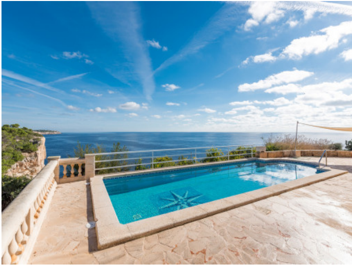
Gorgeous pool area next to the sea