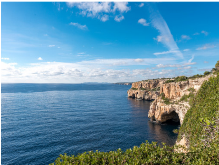
View of the sea and the cliffs