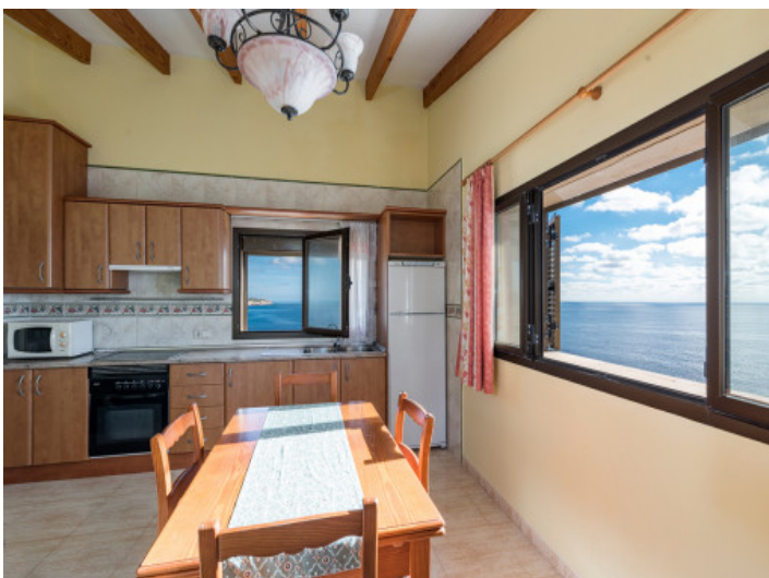
Dining area and kitchen with panoramic views