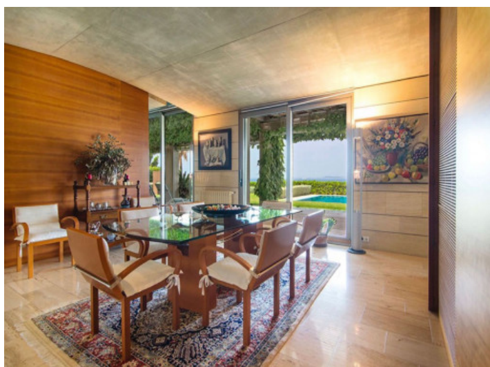
Luxurious dining area with terrace access