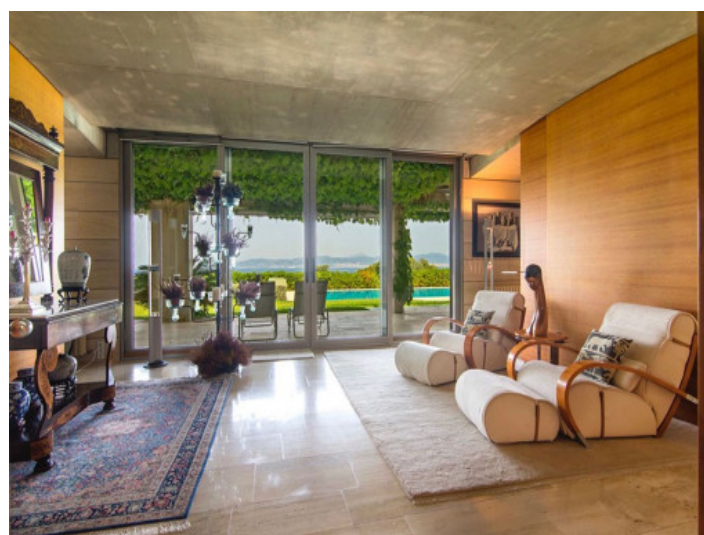
Fabulous living area with sea views