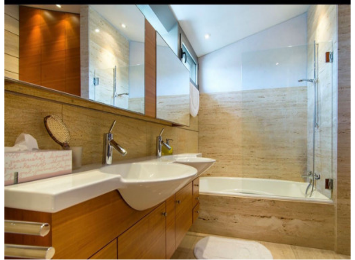
One of 4 bathrooms