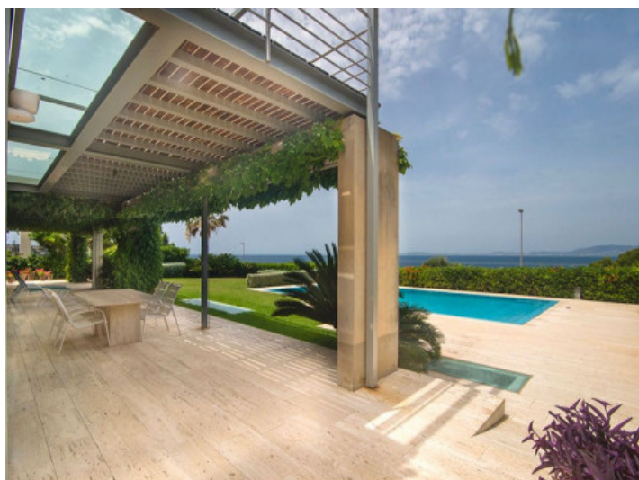
Spacious covered terrace