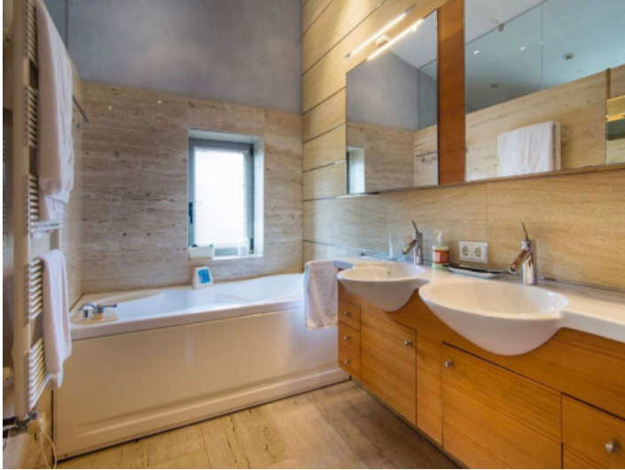
One of 4 bathrooms