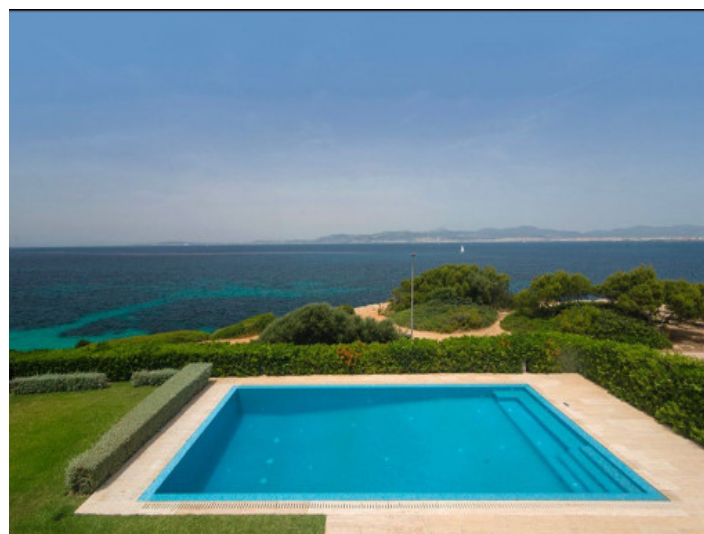
Pool area with sea views