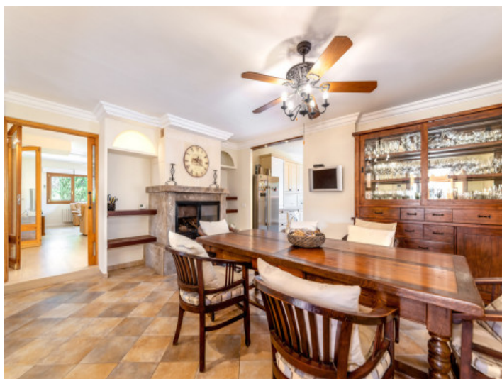
Rustic dining area