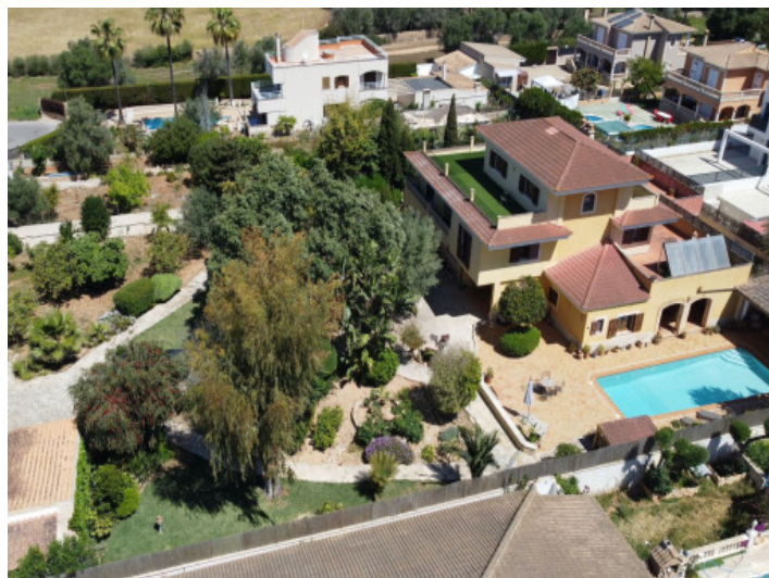
Townhouse villa with pool in Lluçmajor