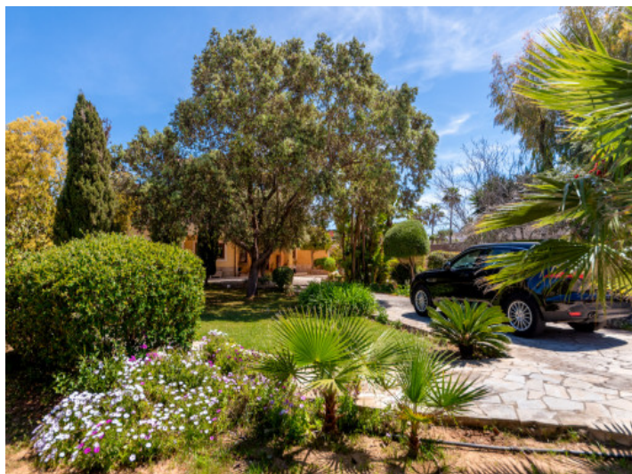
Garden and exterior area of the townhouse