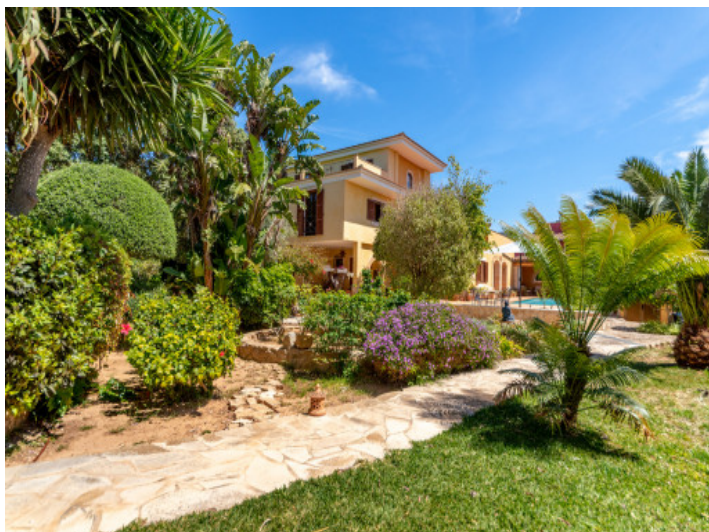
Garden and exterior area of the townhouse