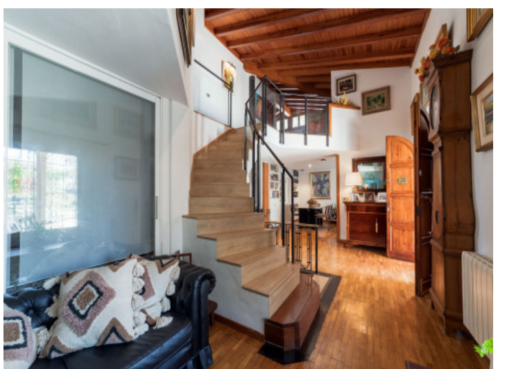
Living area with fireplace Modern kitchen All information is correct to the best of our knowledge. Errors and prior sale excepted. This prospectus is purely for information purposes. Only the notarized deed of sale is legally binding.

PORTA MALLORQUINA • C./ CONQUISTADOR 8, 07001 PALMA TEL. +34 971 698 242 • INFO@PORTAMALLORQUINA.COM