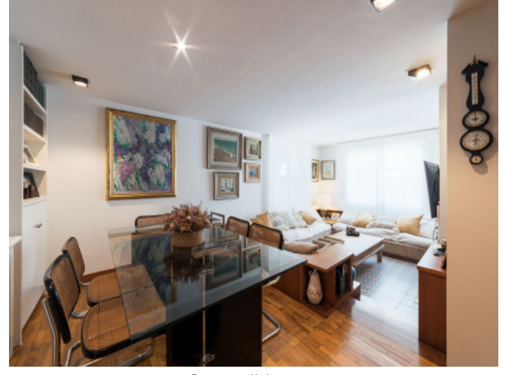
Separate living area