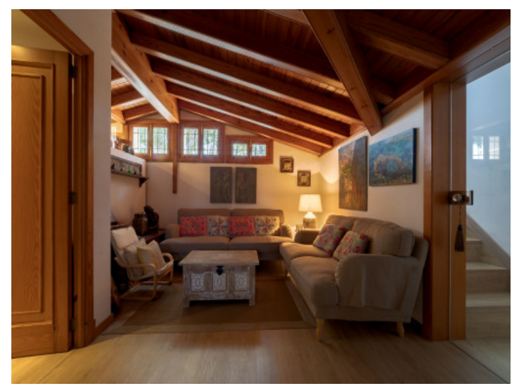
Separate living area Dining area All information is correct to the best of our knowledge. Errors and prior sale excepted. This prospectus is purely for information purposes. Only the notarized deed of sale is legally binding.

PORTA MALLORQUINA • C./ CONQUISTADOR 8, 07001 PALMA TEL. +34 971 698 242 • INFO@PORTAMALLORQUINA.COM