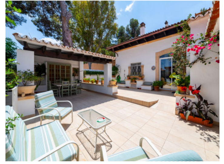
Sunny terrace and dining area

PORTA MALLORQUINA® Your home. Our passion.