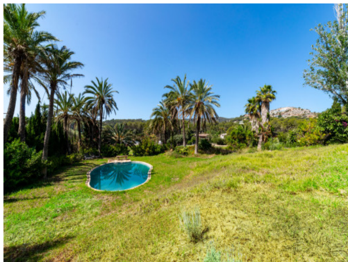
Garden and pool area