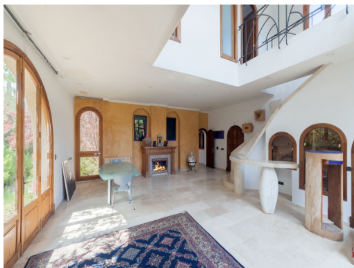
Noble entrance area