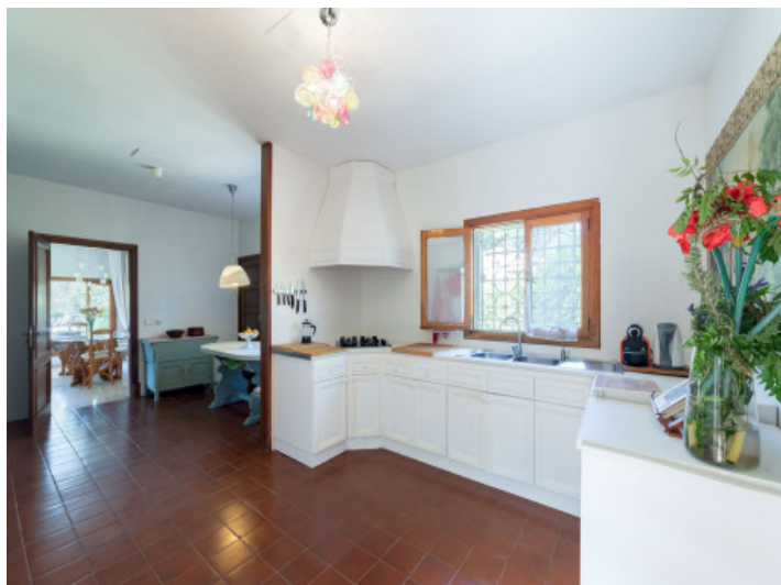
Kitchen in white