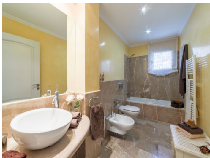
One of 5 bathrooms