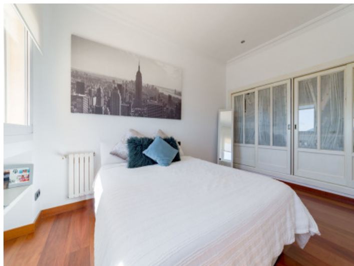
One of 5 bedrooms