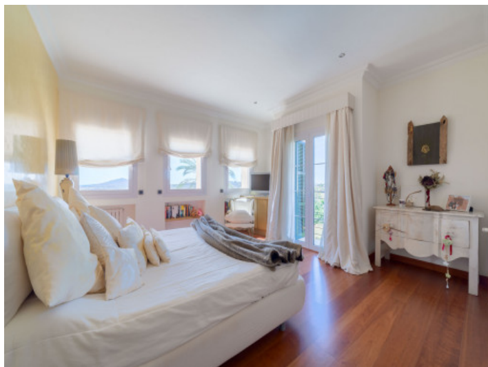
One of 5 bedrooms