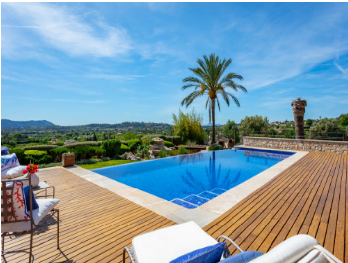
Large pool with sweeping views

All information is correct to the best of our knowledge. Errors and prior sale excepted. This prospectus is purely for information purposes. Only the notarized deed of sale is legally binding.