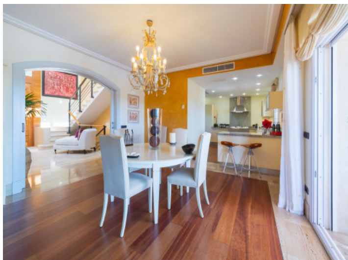
Open dining area