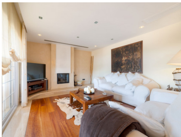
Cosy living room