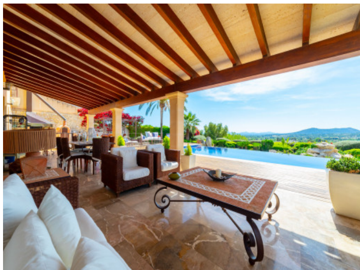
Fabulous covered terrace with fantastic views