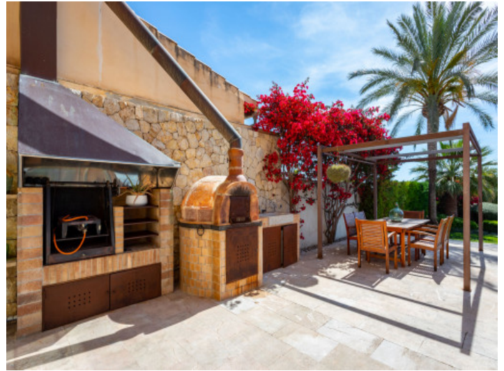
Spacious BBQ area