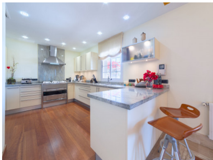
Modern, fully equipped kitchen

All information is correct to the best of our knowledge. Errors and prior sale excepted. This prospectus is purely for information purposes. Only the notarized deed of sale is legally binding.