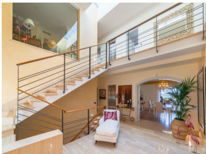
Impressive entrance hall