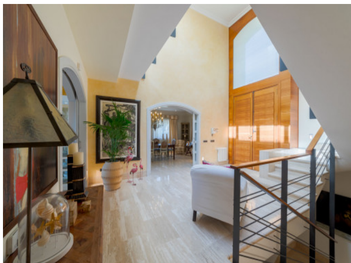
Entrance area with high ceilings