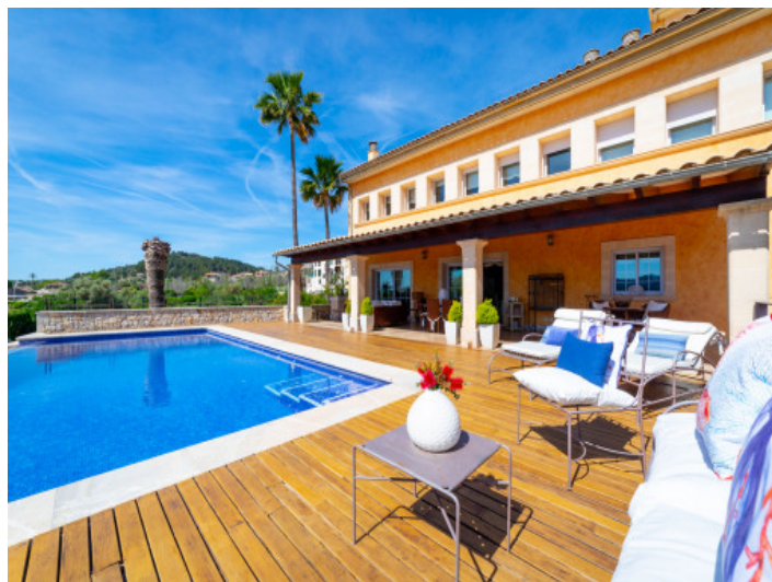
Luxurious pool area