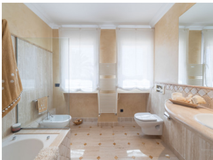
One of 5 bathrooms