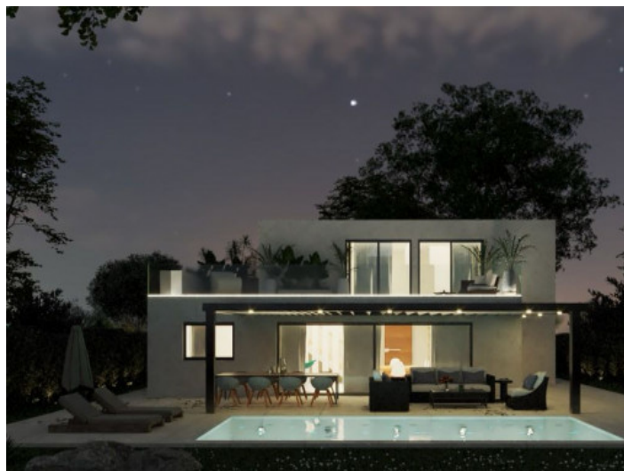
Villa by night