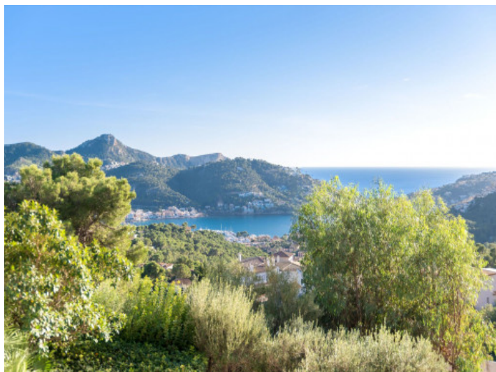
Stunning views to Port Andratx