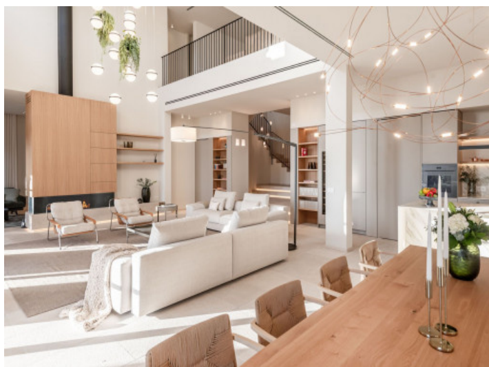
Open-plan living space