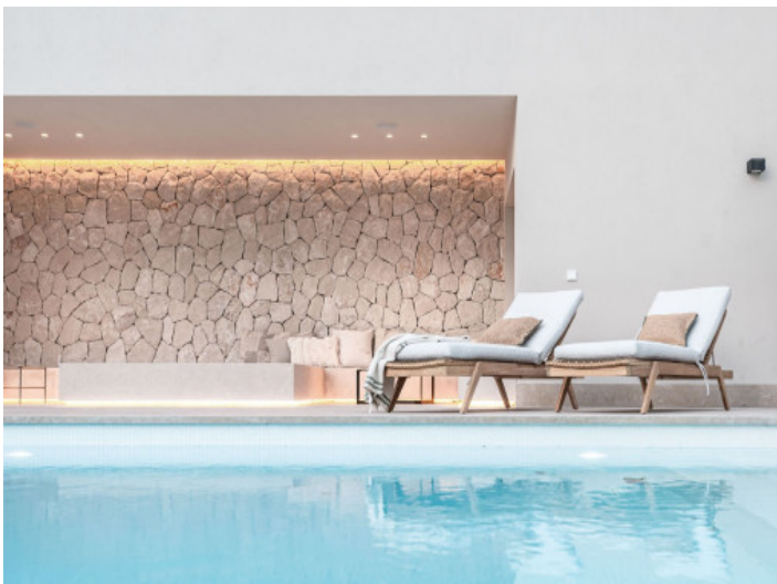
Elegant pool area