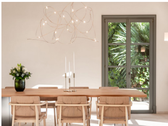
Tastefully furnished dining area