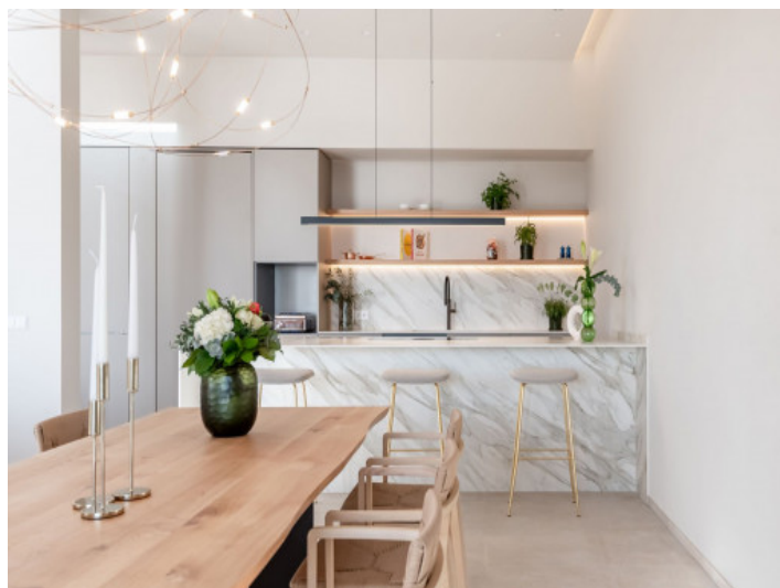
Open high-quality kitchen

All information is correct to the best of our knowledge. Errors and prior sale excepted. This prospectus is purely for information purposes. Only the notarized deed of sale is legally binding.