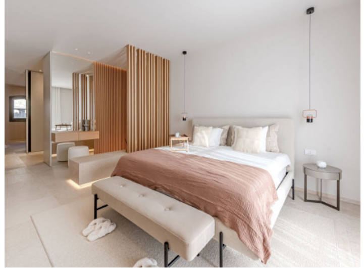
Modern villa with Mediterranean elements and breathtaking harbour views