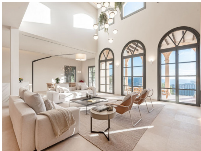
Modern living area