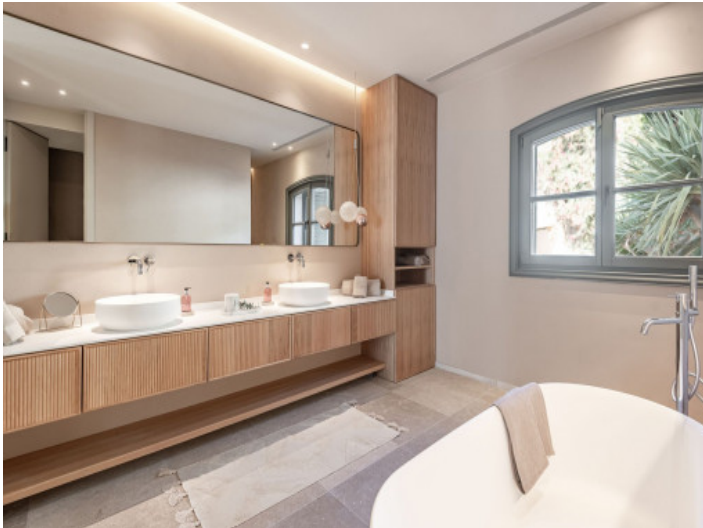
Elegant luxury bathroom