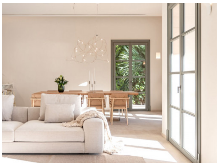
View to the dining area