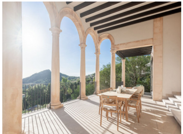
Covered terrace with a view

All information is correct to the best of our knowledge. Errors and prior sale excepted. This prospectus is purely for information purposes. Only the notarized deed of sale is legally binding.