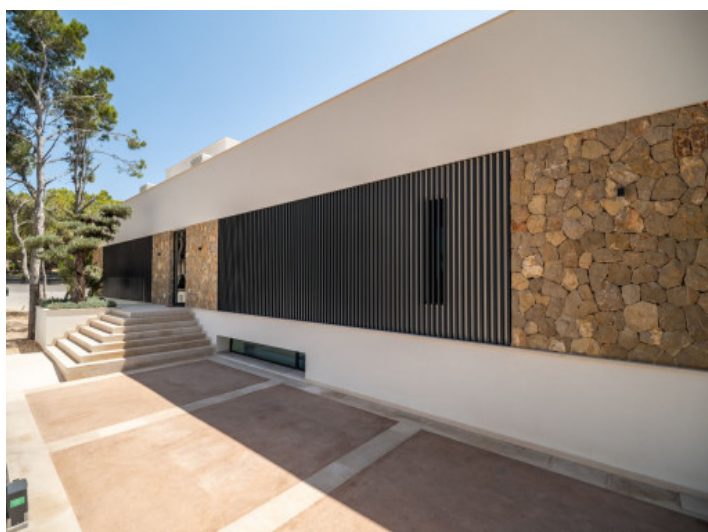
Front facade and parking space