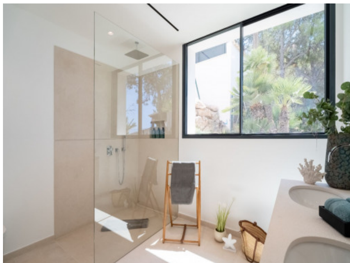
One of 5 bathrooms