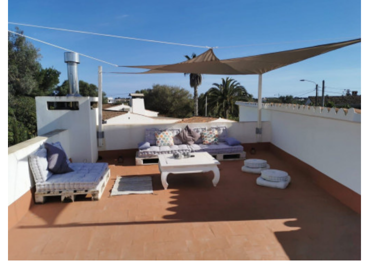
Sunny roof terrace