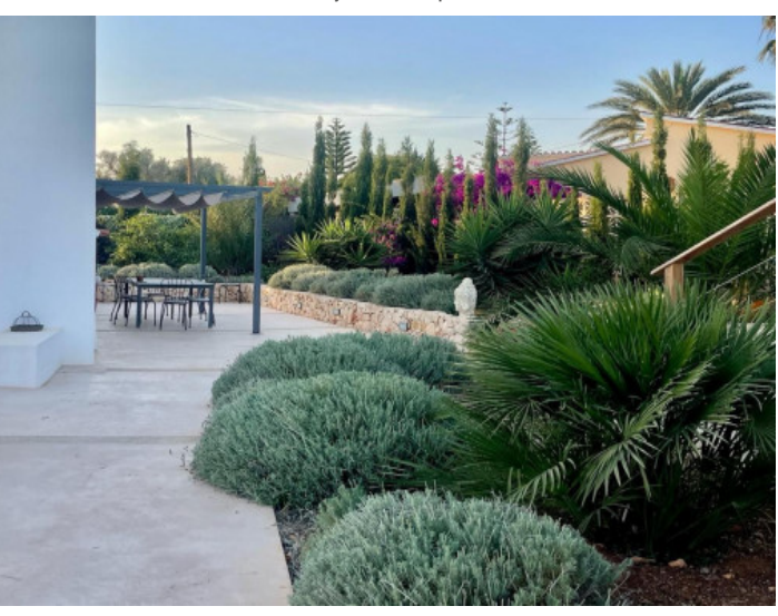
Mediterranean outdoor area