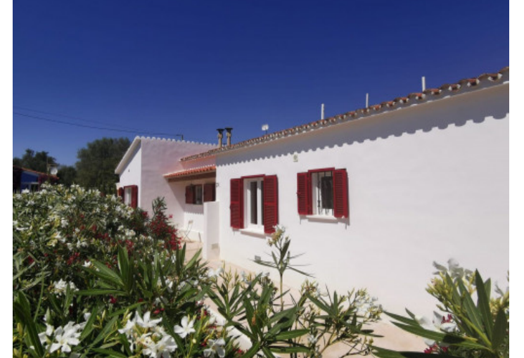
Exterior view of the house