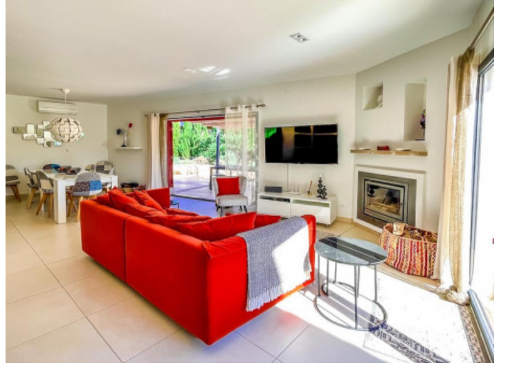
Lightflooded living and dining area