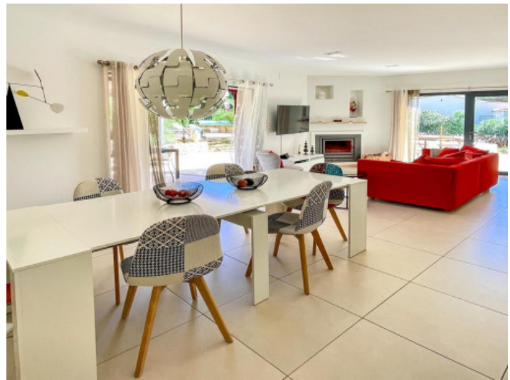
Modern living and dining area