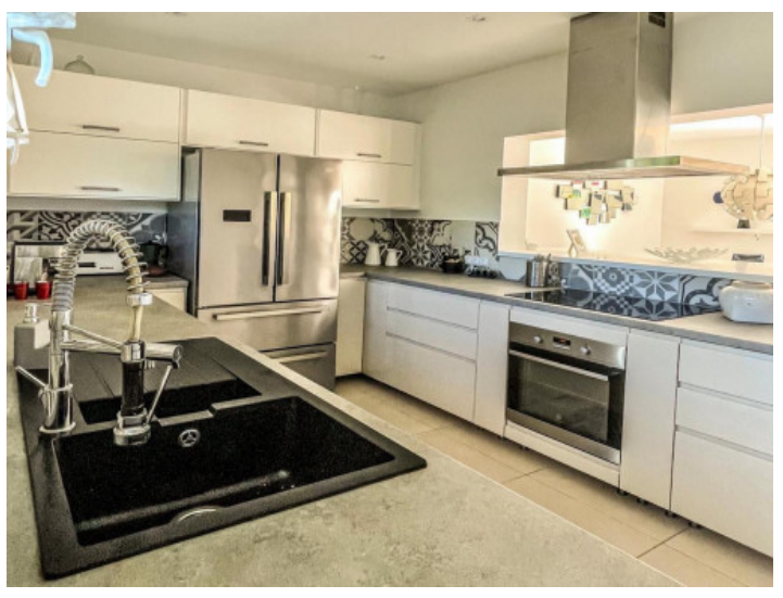
Large modern kitchen