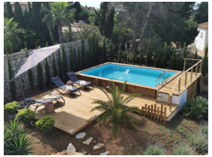
Beautifully laid-out pool area