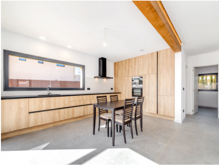
Beautiful, open kitchen