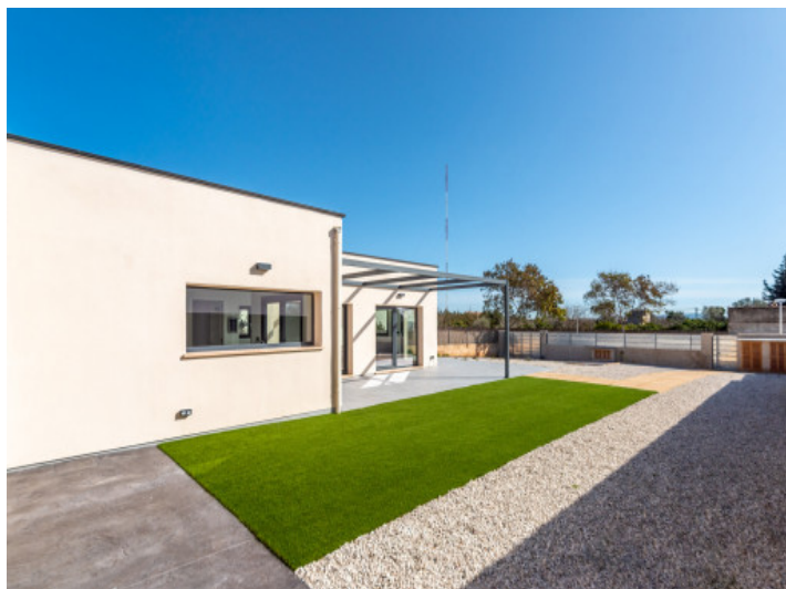
Large outdoor area