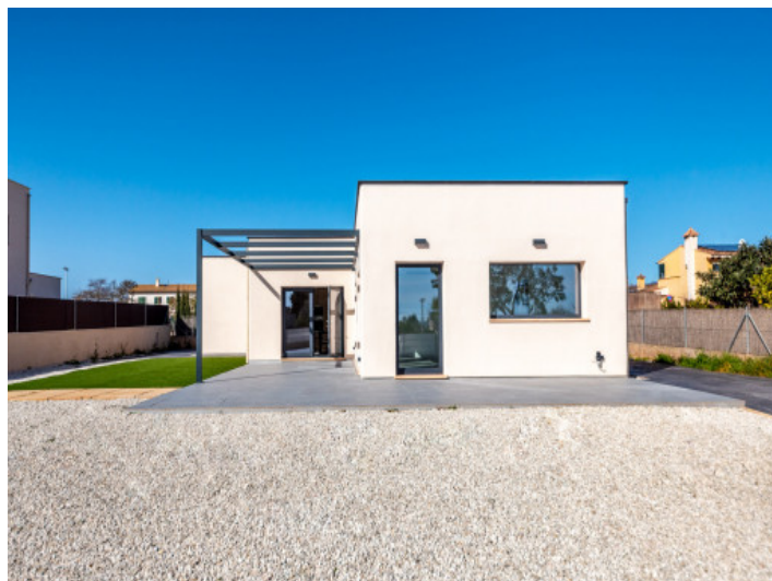
Exterior view of the passive house