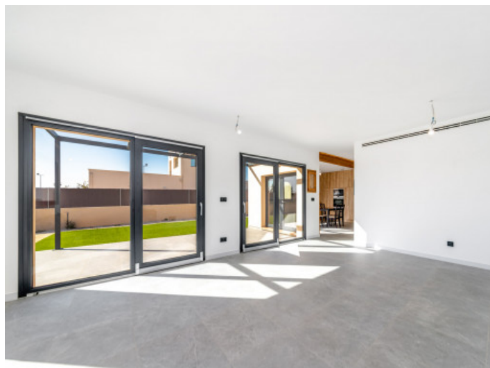
Direct terrace access from the living area