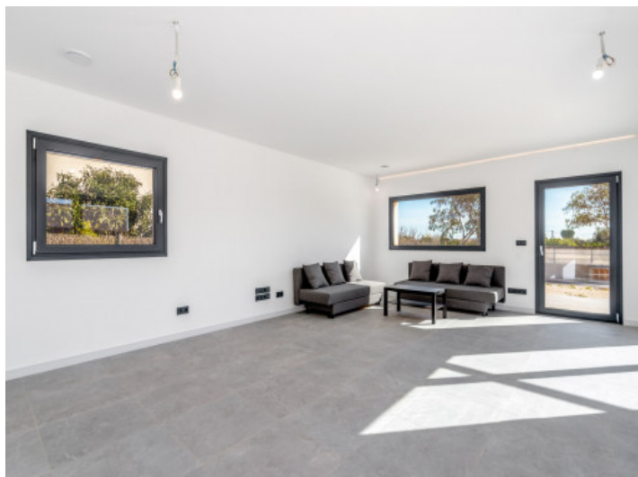
Lightflooded living area