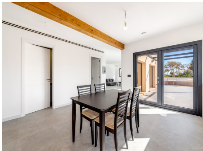
Adjoining bright dining area