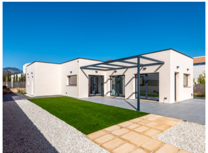
Passive-house and terrace

All information is correct to the best of our knowledge. Errors and prior sale excepted. This prospectus is purely for information purposes. Only the notarized deed of sale is legally binding.