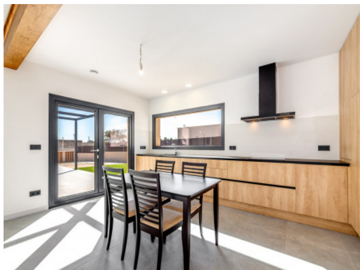
Modern kitchen with terrace access

All information is correct to the best of our knowledge. Errors and prior sale excepted. This prospectus is purely for information purposes. Only the notarized deed of sale is legally binding.