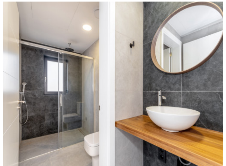
Modern shower bathroom