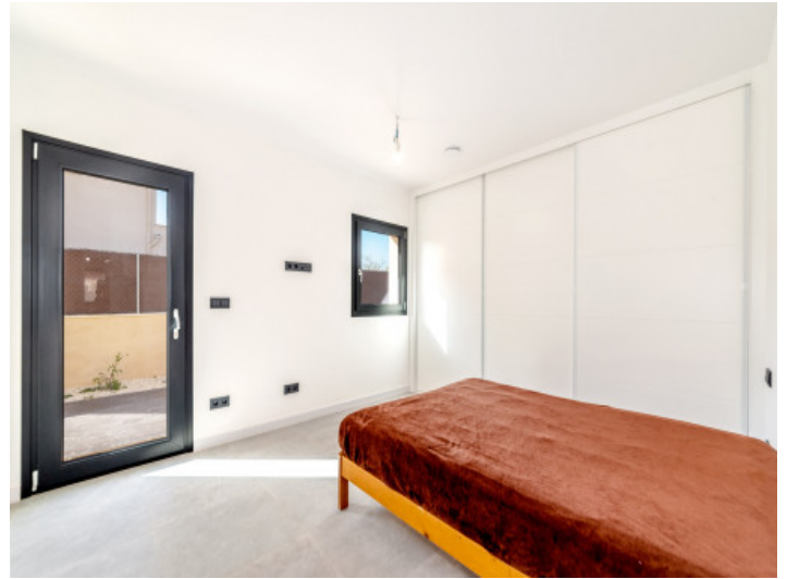
Bedroom with access to the outside