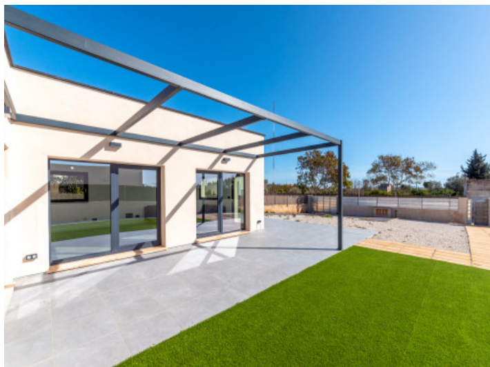
Large sunny terrace