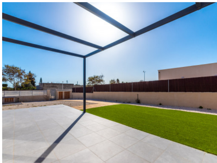
Terrace and garden with ample space