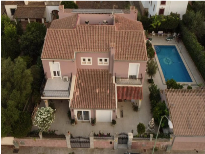
Exterior view and pool