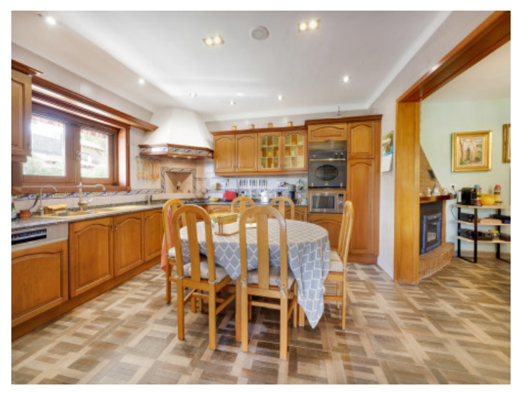
Contry style kitchen