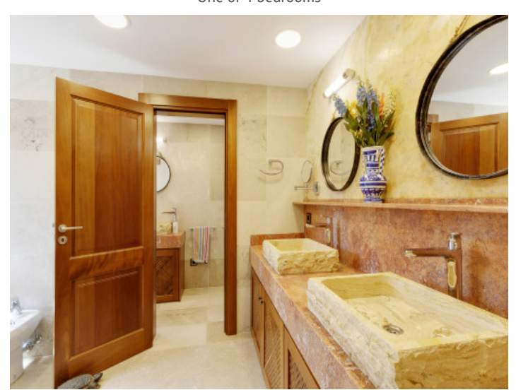
Finca with 5 bathrooms