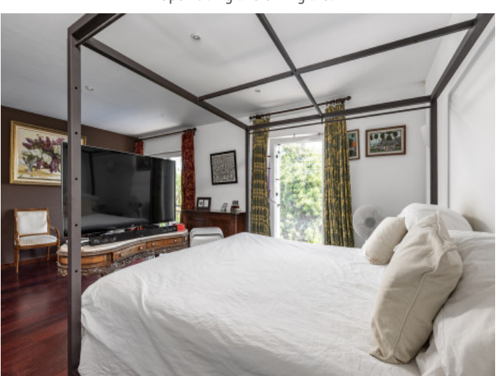
Spacious double bedroom Another bedroom All information is correct to the best of our knowledge. Errors and prior sale excepted. This prospectus is purely for information purposes. Only the notarized deed of sale is legally binding.