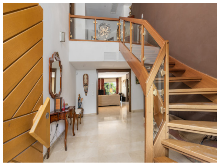
View of the floor