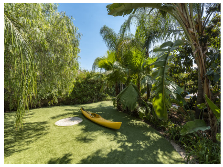
Large garden area

PORTA MALLORQUINA® Your home. Our passion.