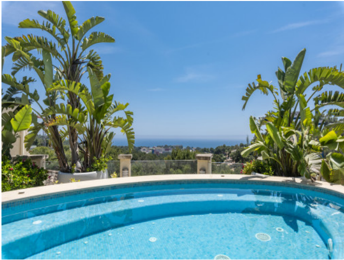
Splendid views to the sea