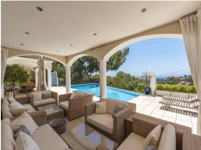
Chill Out area by the pool