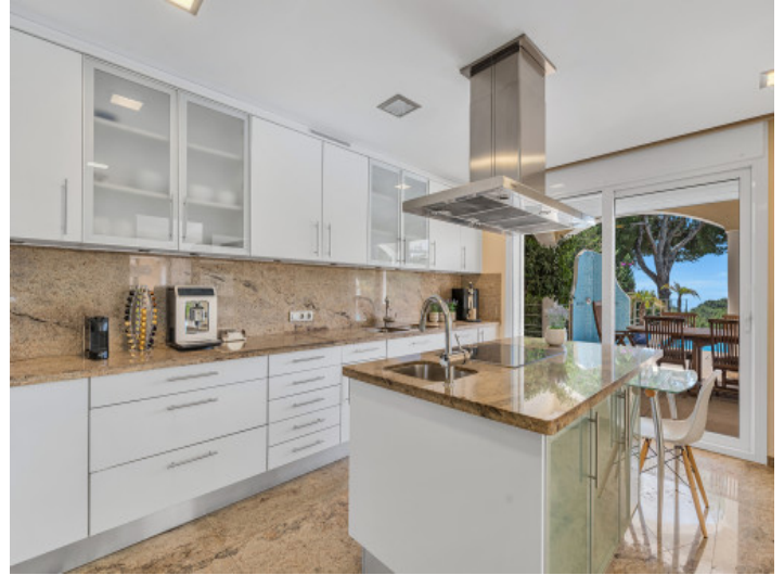
Noble kitchen with cooking island