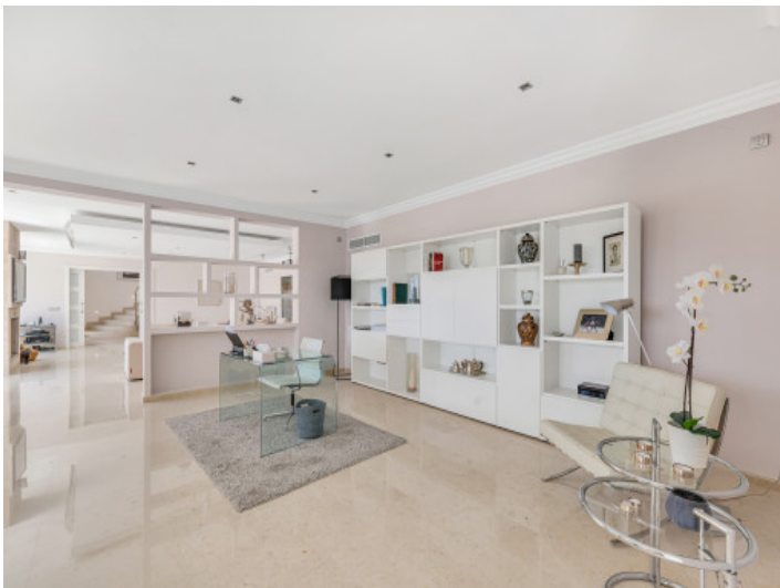
Separate office area