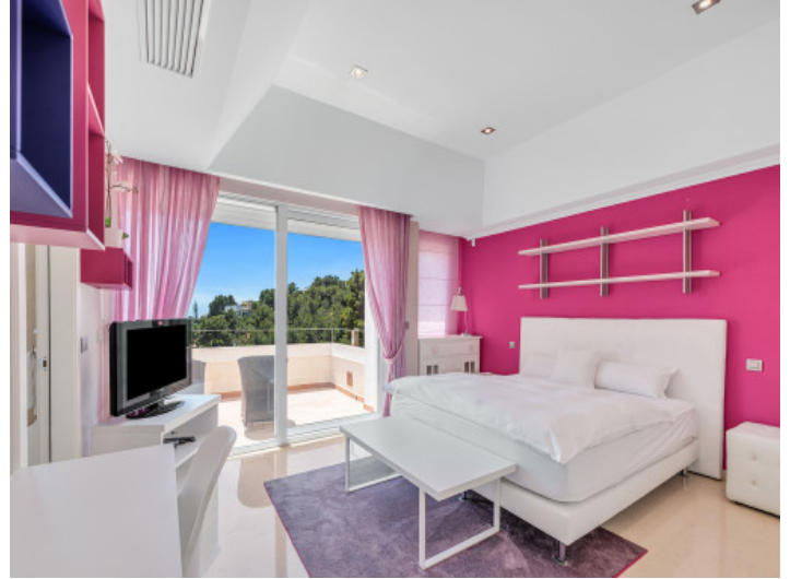
Bedroom with balcony access