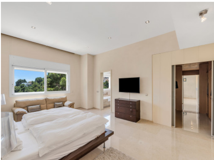
Living area with bathroom en suite