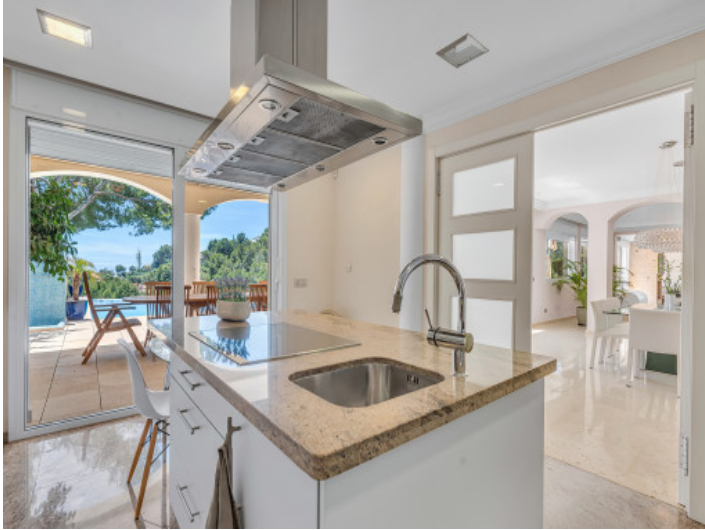
Noble kitchen with cooking island