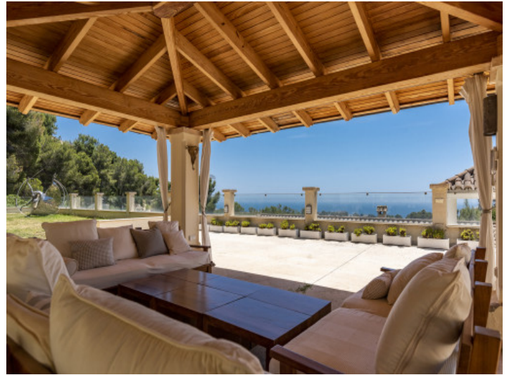
Chill-Out area at the pool