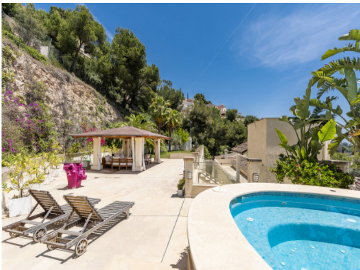
Terrace and jacuzzi