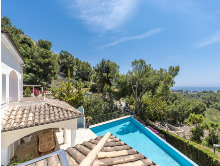
View from the top