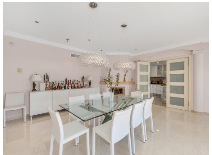
View to the kitchen

All information is correct to the best of our knowledge. Errors and prior sale excepted. This prospectus is purely for information purposes. Only the notarized deed of sale is legally binding.