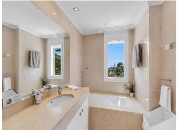
Bathroom with shower and bath tub