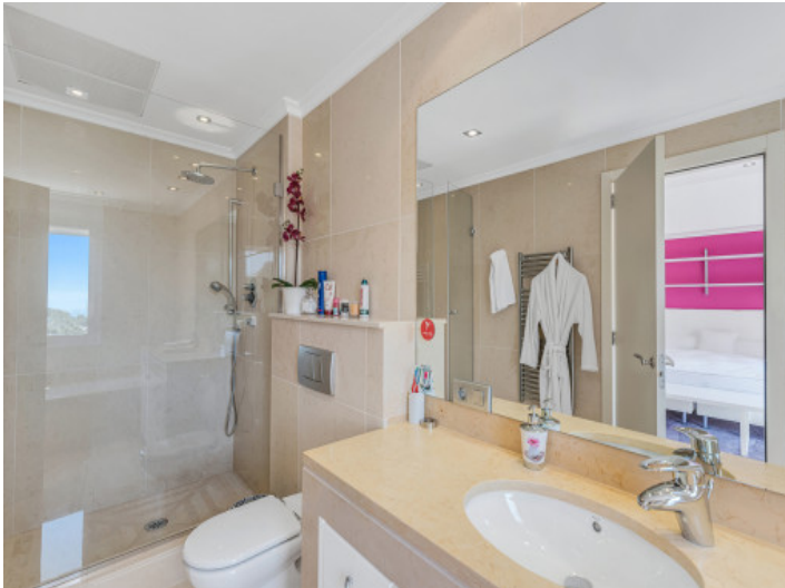
Bathroom with shower and bath tub