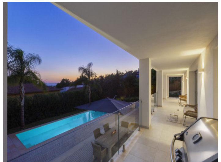
Balcony by night

All information is correct to the best of our knowledge. Errors and prior sale excepted. This prospectus is purely for information purposes. Only the notarized deed of sale is legally binding.