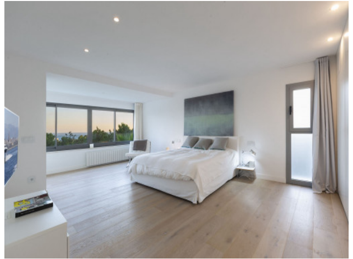
Master bedroom with large windows