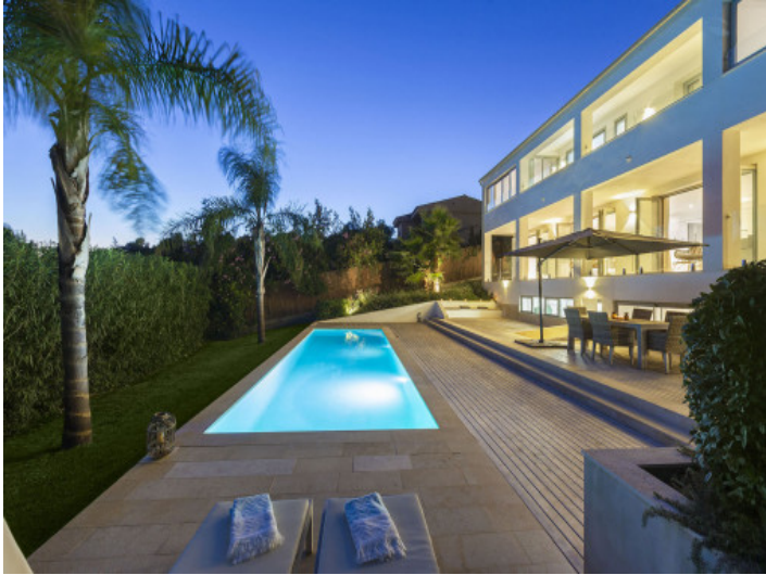
Romantic pool area by night