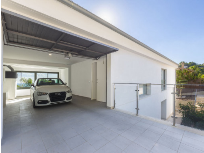
Garage of the villa