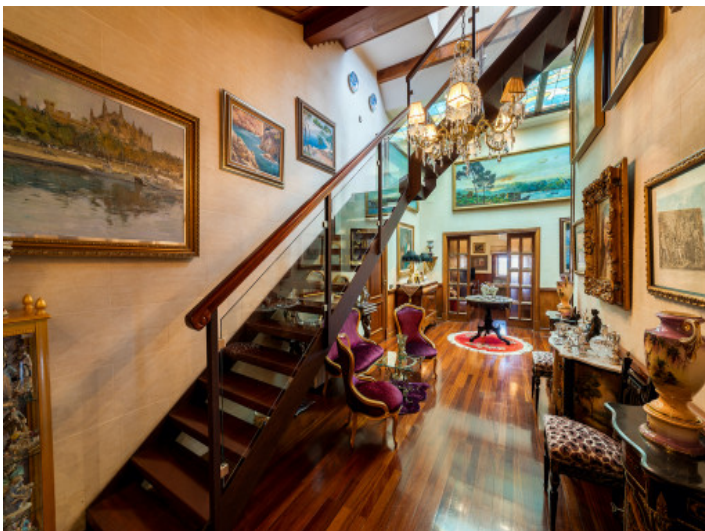
Hall on the upper floor