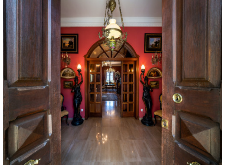
Entrance to the villa