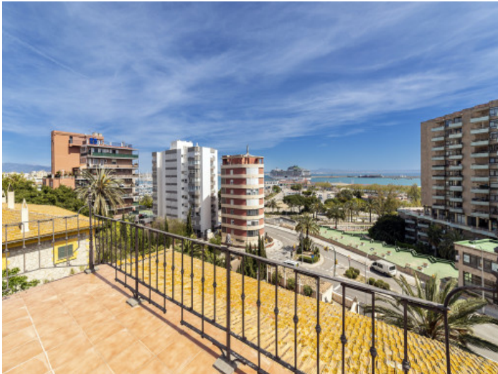
Large terrace with sea views