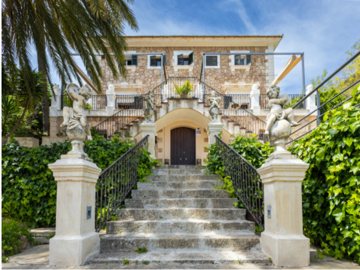
Exterior view and access to the villa