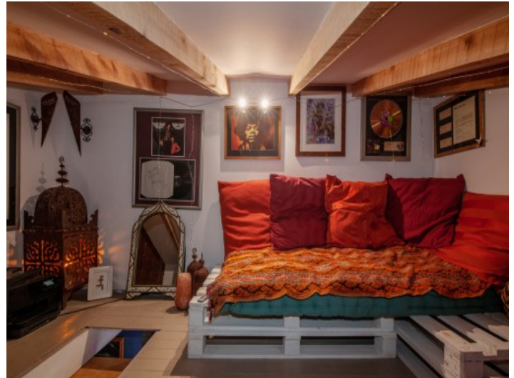
Alternative chill out area