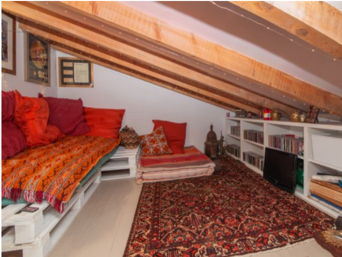
Alternative chill out area