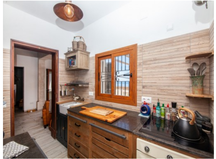
Rustic kitchen of the house