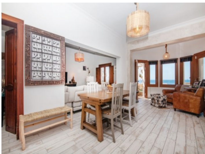
Light flooded living and dining area