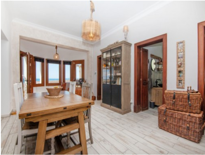
Light flooded living and dining area