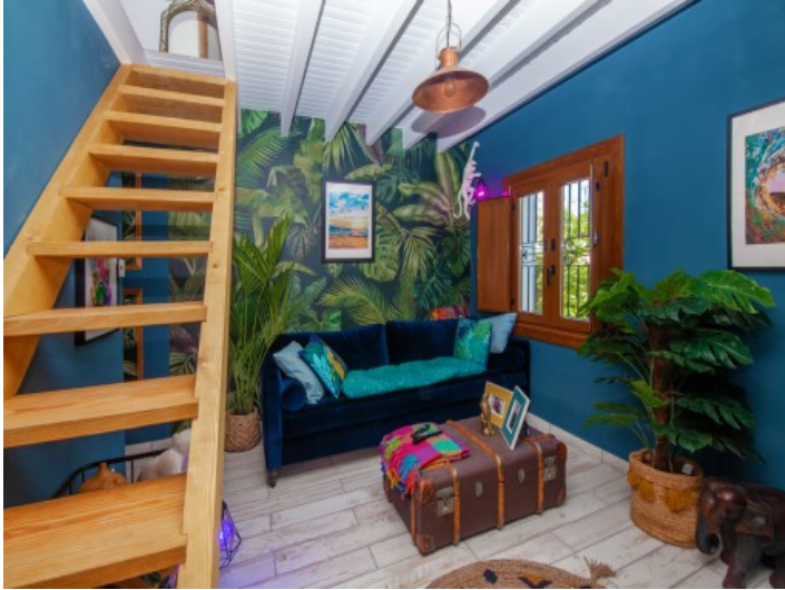
Inviting chill out area