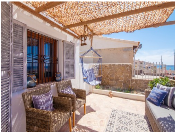
Sitting area on the terrace