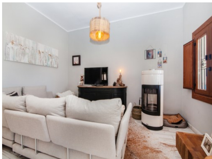
Cozy living area with fire place

All information is correct to the best of our knowledge. Errors and prior sale excepted. This prospectus is purely for information purposes. Only the notarized deed of sale is legally binding.