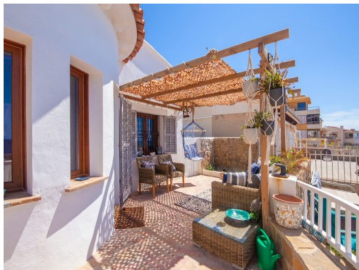
View of the large terrace