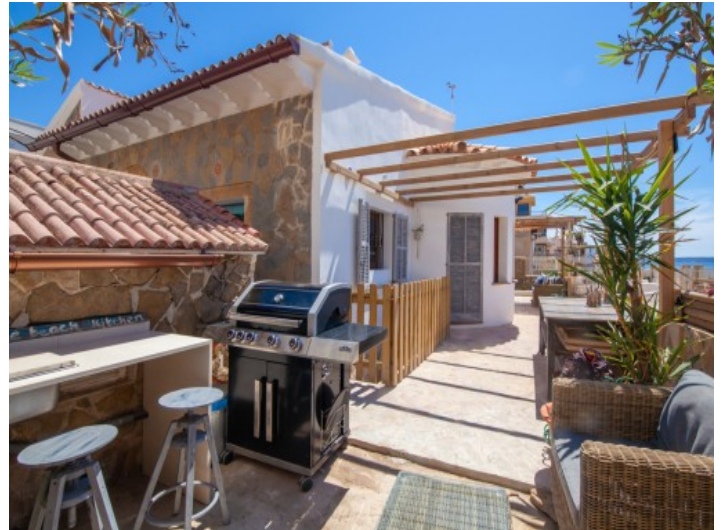
Exterior kitchen and terrace