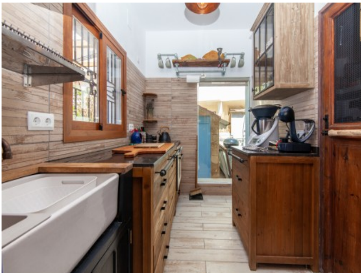
Rustic kitchen of the house