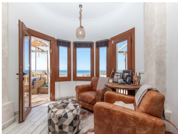
Light flooded living and dining area