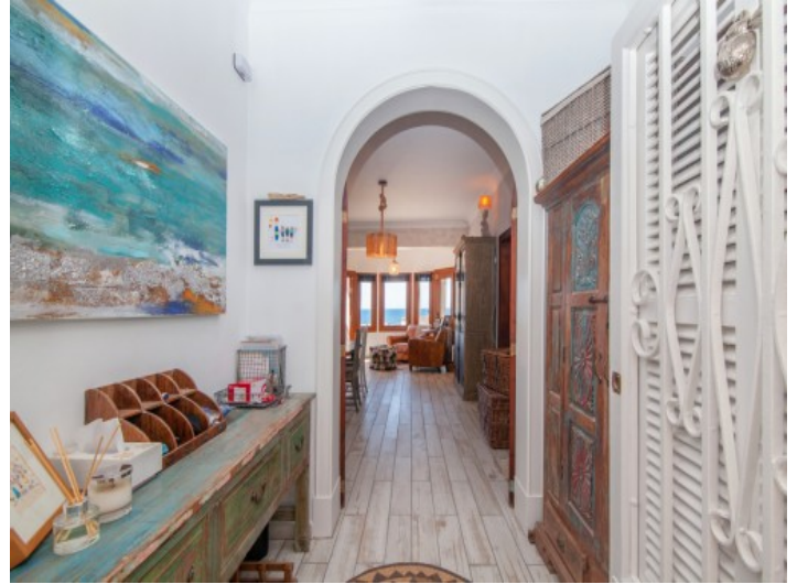
View of the floor