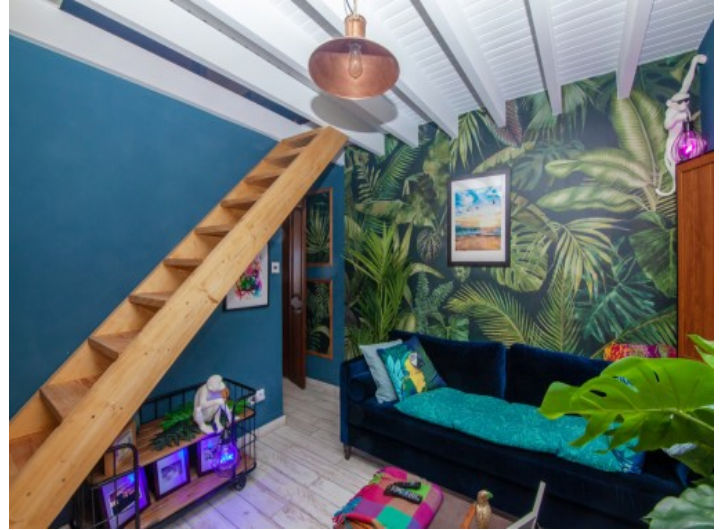
Inviting chill out area